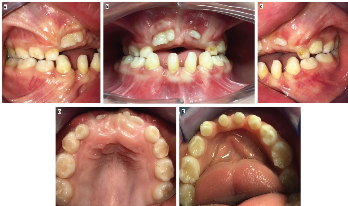
Fig. 2: Intraoral vision A. Right side view, B. Front view, C. Left side view, D. Superior occlusal view, E. Inferior occlusal view.