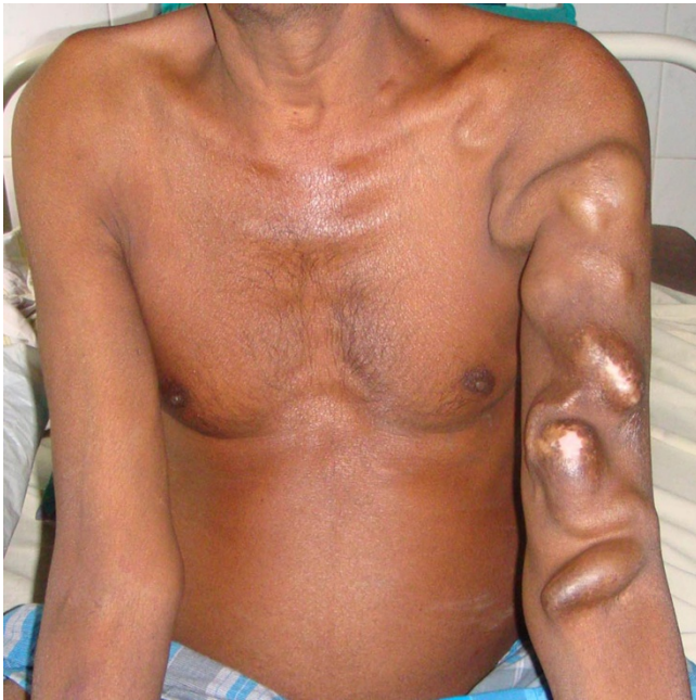
Figure 1 Giant arteriovenous fistula. Photograph of the patient's upper body, with the left arm showing a giant arteriovenous fistula extending from the cubital fossa of the left arm up to the left supraclavicular area.

breathlessness over the past 15 days. There was no history of associated chest pain, palpitations, syncope, cough, expectoration, or orthopnea.