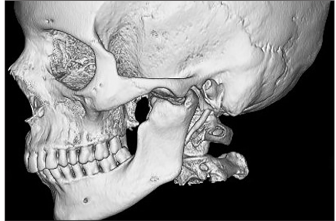
Figure 6: Three-dimensional computed tomography face postoperative at 4 months, with absence of residual tumour/recurrence

in the mandible, maxilla, external auditory meatus, temporal bones and pterygoid plates. The mandible is more frequently involved than the maxilla with reports of incidence ranging from 64% [1] to 81.3%, respectively. [4] Lesions are usually located in the angle and margin of the mandible. Osteoma is most frequently observed in the second and fifth decades of life. Osteomas are usually solitary; if multiple, the patient should be evaluated for Gardner's syndrome.