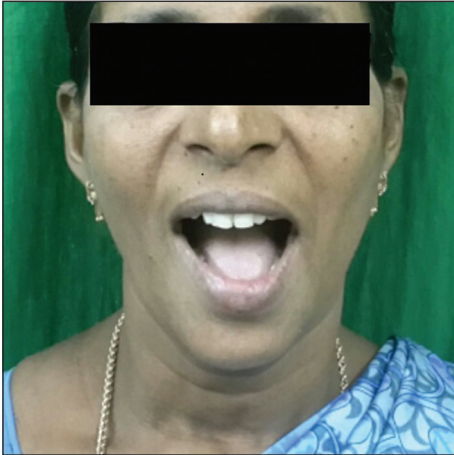
Figure 5: Post-operative photo, absence of swelling over left pre-auricular region