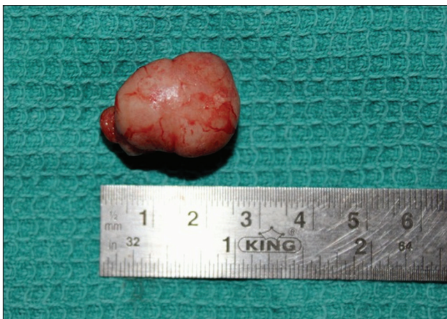
Figure 3: Excised specimen measuring 3.0 cm × 2.5 cm × 2.0 cm