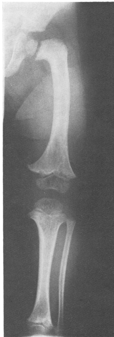
FIG. 2.—X-ray of left lower limb of patient showing widening, cupping, and defective mineralization of the metaphyses.

X-rays. The skeleton showed generalized changes of typical metaphyseal dysostosis, i.e. widening, cupping, and defective mineralization in the metaphyses of the tubular bones (Fig. 2).