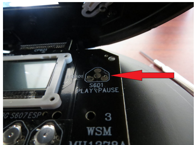
Figure 1. A close-up image of the exposed upper integrated circuit board of a CD player (INSIGNIA NS-P4112; INSIGNIA Products, Richfield, MN). When the 4 contact poles (indicated by red arrow) associated with the play button are connected by an electrically conductive medium, the unit begins playing.

All broadcast systems contained 1 of 2 portable CD player models (INSIGNIA NS-P4112 or INSIGNIA NS-P113; INSIGNIA Products, Richfield, MN). The play buttons on both CD player models utilize a momentary action pushbutton switch that, when depressed, connects power required to play the CD to 4 contact poles on the integrated circuit board via a convex disk of flexible metal (Fig. 1). In 2012, we rotated 18 broadcast systems among treatment sites on a bi-weekly schedule, and each time a unit was placed at a treatment site, a trained technician used a combination of adhesive tape, rubber bands, metal pins, square keys, sticky