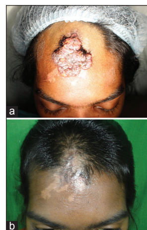
Figure 1: (a) Clinical preoperative image showing a 4 cm x 3 cm mulberry like swelling over the forehead abrasion site. (b) Clinical postoperative image showing areas of spontaneous epithelisation and growth of hair

Department of Plastic Surgery, Christian Medical Collage and Hospital, Vellore, Tamil Nadu, India