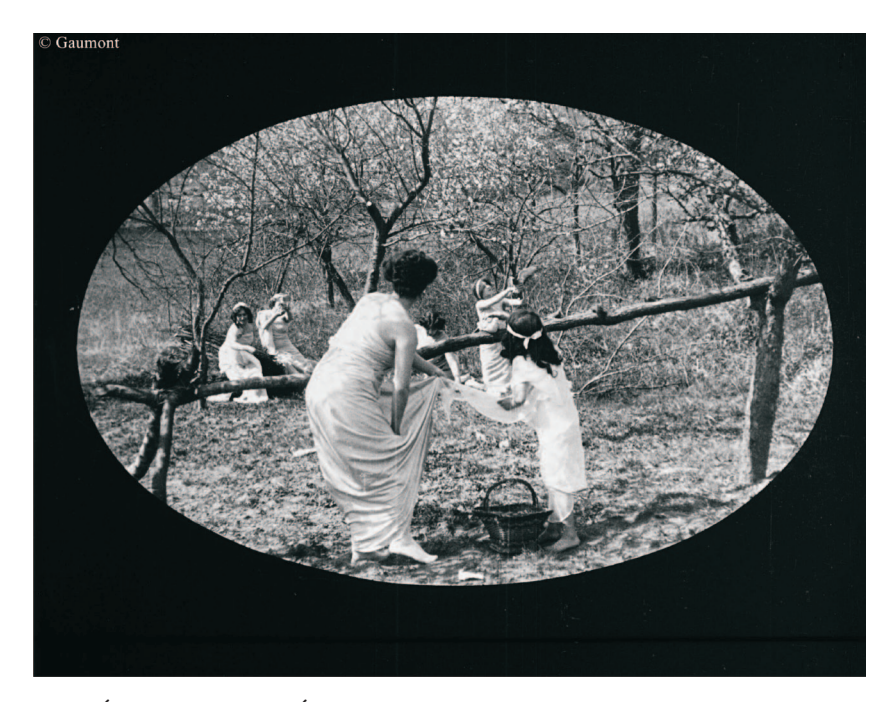
Figure 8. L'Éventail animé (Émile Cohl, F 1909, © Gaumont).