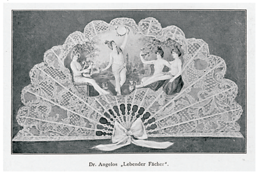
Figure 10. L'Éventail animé (Émile Cohl, F. 1909, © Gaumont), Figure 11. Porcelaines tendres (Émile Cohl, F. 1909, © Gaumont).