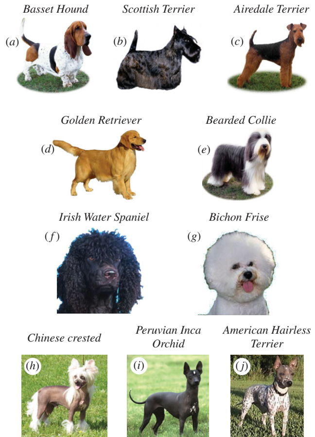
Figure 1. Combinations of alleles produce distinctly different pelage phenotypes. Combinations of alleles at five genes— RSPO2 , which controls fur growth pattern or furnishings; FGF5 , which controls much of the fur length phenotype, and KRT71 , which contributes to curl; and FOXI3 and SGK3 , which produce hairlessness—are shown. Dogs showing the distinct phenotypes are presented to the right with letters (a)–(j) corresponding to the combinations of genotypes on the left. Revised from [15].

length, curl, growth pattern, shedding and hairlessness are among those that have been associated with specific mutations (figure 1). We review current thinking regarding each of these and present new data on hairlessness in dogs.