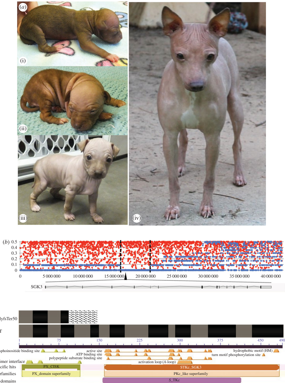
Figure 2. Homozygosity due to strong selective pressure identifies a deletion in SGK3 that causes the hairless trait found in the AHT. (a) AHTs are born with sparse fur and quickly lose it over the first few weeks after birth. Images (i) newborn; (ii) two weeks; (iii) five weeks; (iv) adult. (b) Pattern of heterozygosity ( H_e ) over chromosome 29 in AHT (blue) and 858 dogs from 89 breeds (red). SNP positions along chromosome 29 from the centromere to the telomere are on the x-axis, H_e is on the y-axis. The boundaries of the homozygous region are indicated with dotted lines and the position of the SGK3 gene is indicated by the black triangle. (c) Schematic of the SGK3 gene with and without the AHT mutation. Black and grey bars in the genes denote the exons as predicted by Ensembl [44]. The wavy lines indicate the predicted nonsense sequence produced by the frame shift. Putative active sites and protein domains are shown below the gene. The protein domains are predicted by NCBI-conserved domain database [45].

the parts of those genes that control various phenotypes that are of interest to human geneticists, developmental biologists and those studying both rare and common diseases. In this study, we focused on the simple phenotype of dog fur leaving aside the issue of coat colour. Defining phenotypes such as length,