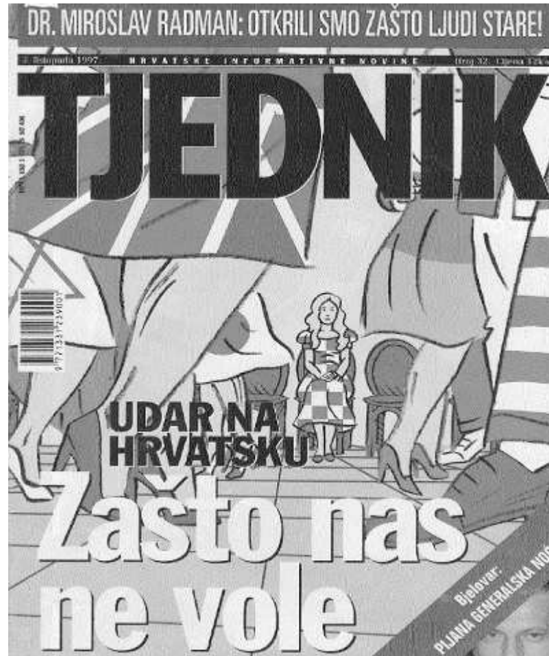
Figure 3: A 1997 Croatian liberal weekly, Tjednik, asks incredulously, “Why don’t they love us?”

funds—many Croats began to draw the border of the Balkans between Bosnian Croats and citizens of Croatia proper. 19