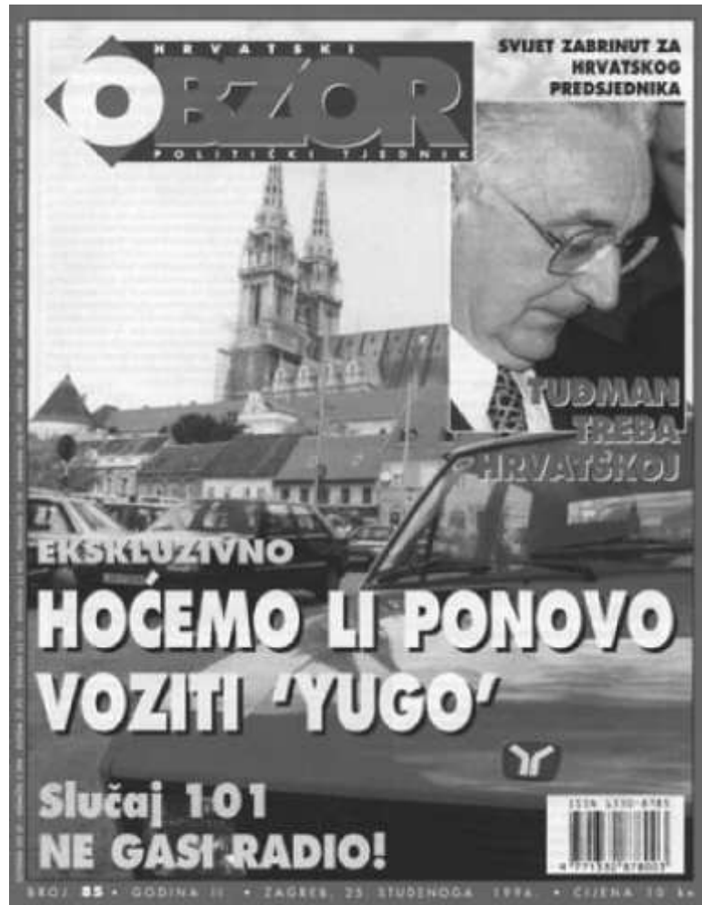
Figure 4: The conservative weekly Hrvatski Obzor proclaimed in 1997, “Croatia still needs Tuđman”

During his televised State of the Union Address in January 1997, Tuđman made his stand on SECI official by passing a constitutional amendment banning Croatia's participation in Balkan associations. He proclaimed,