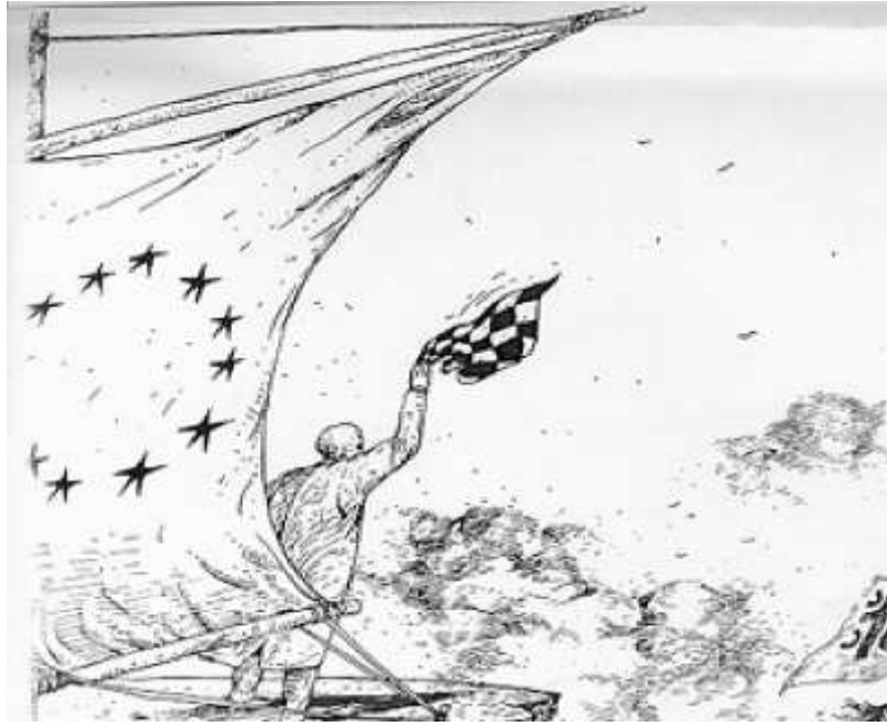
Figure 1: At the beginning of the conflict with Serbia, many Croatians were optimistic they would sail into Europe