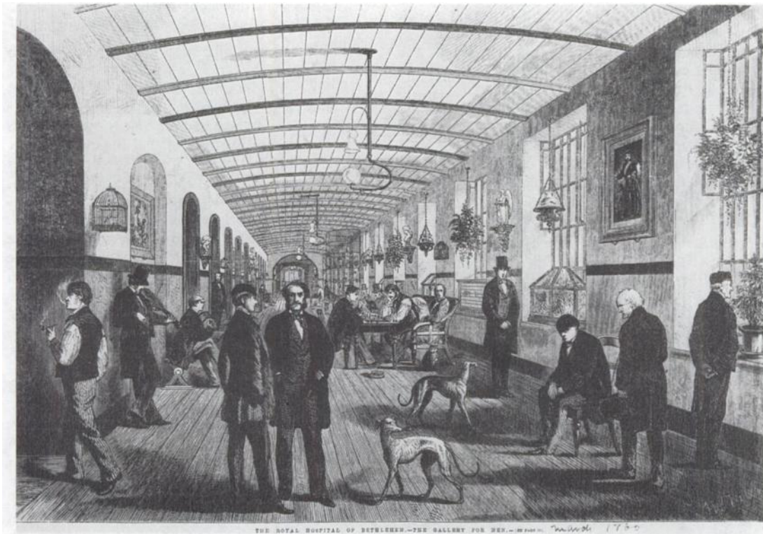
A men's ward in Bethlem Hospital, 1860, from 'The Illustrated London News'.