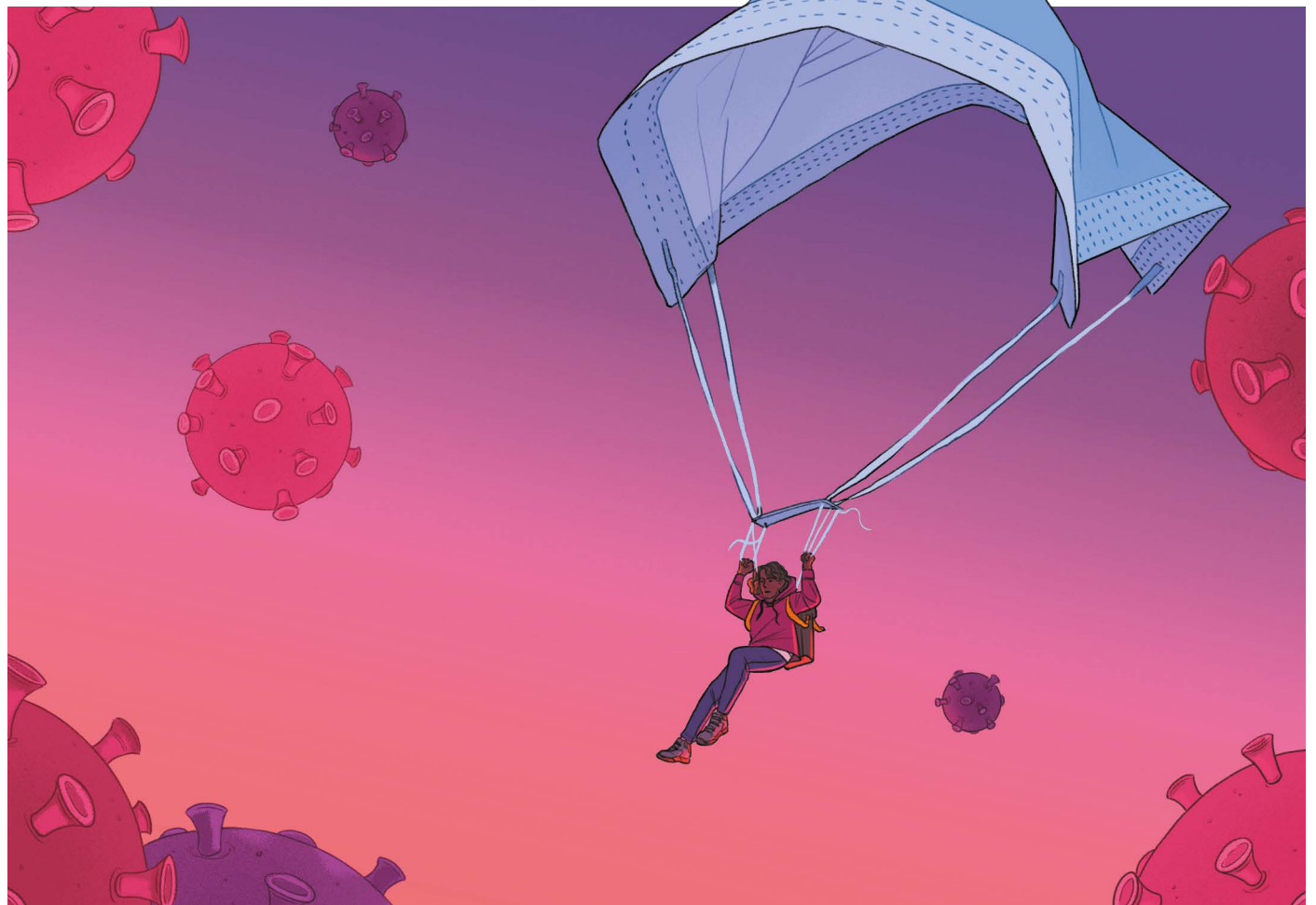
ILLUSTRATION BY BEX GLENDING