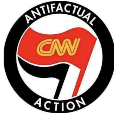
Fig. 9. Examples of ‘right’ RU-IRA tweets criticizing traditional media.

In summary, RU-IRA accounts among both the left and right leaning clusters converged to position traditional media outlets as institutions which manufacture a false reality for masses of people. This aligns with previous speculations [45] suggesting that undermining trust in established media sources can be a characteristic of disinformation, with the end goal of further destabilizing democratic discourse.