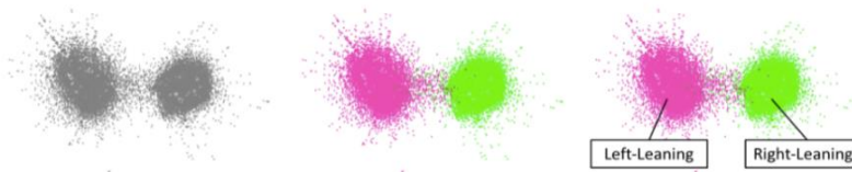
Fig. 1. From left to right: using Force Atlas 2 to visualize retweet flows, identifying clusters with Infomap, and using cluster characteristics to label communities

Next, we identify accounts from within our data that were associated with the RU-IRA and examine their location within the retweet network graph. In total, there were 96 RU-IRA accounts within our dataset but only 29 of these appeared in our retweet network graph (limited to accounts with a retweet degree of at least two and within the two clusters). 22 of these accounts were in the left (pro-BLM) cluster and 7 of these accounts were in the right (anti-BLM) cluster.