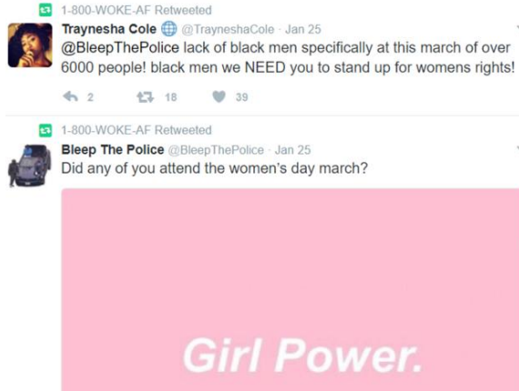
Fig. 5. Three RU-IRA accounts retweeting each other.

impression that they were part of a social clique. Their occasional, casual interactions projected authenticity while also enabling them to better manage their audience’s attention by generating ‘buzz’ around certain topics such as protests or other news items. Figure 5 below furnishes an example that succinctly captures the flavor of interactions between these accounts.