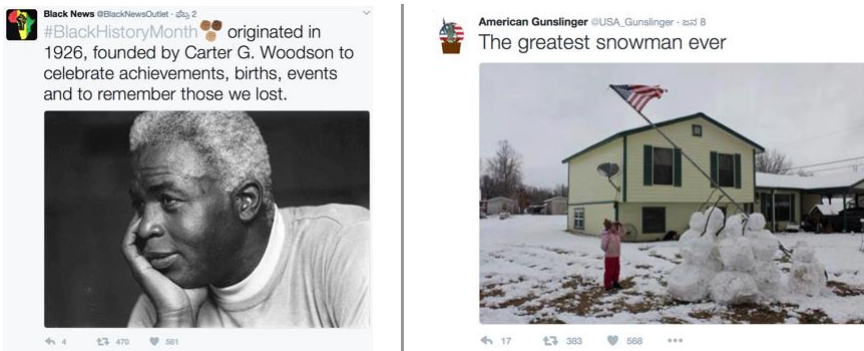
Fig. 4. Sample tweets circulated by RU-IRA accounts in separate clusters to cultivate trust.

Other accounts like @USA_Gunslinger and @KarenParker93 followed similar patterns and used hashtags like #WednesdayWisdom to tweet pictures of snowmen holding up an American flag (see Figure 4) and children pretending to be police officers.