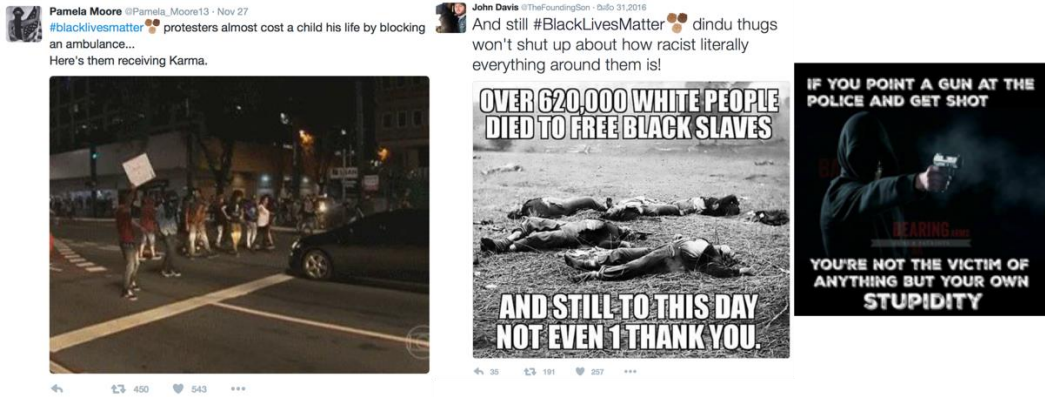
Fig. 7. RU-IRA content about #BlackLivesMatter in right-leaning cluster.

5.3.3 Converging to attack the ‘mainstream’ media: RU-IRA accounts in both clusters converged by using #BlackLivesMatter discourse and their constructed political identities to criticize the ‘mainstream media’. The @BlackmattersUS profile description and website slogan of “I didn’t believe the media so I became one” effectively summarizes this message, which was also carried forward by personal style RU-IRA accounts on the left. These accounts mixed content that A) expressed frustration with how older traditional media institutions cover issues like officer related shootings and the #BlackLivesMatter movement itself; and B) equated these long-standing institutions with tools of oppression. Figure 8 illustrates more and less direct versions of this message. The second tweet in this example shows @BleepThePolice (boosted by another RU-IRA account) repurposing a message by @ShaunKing to hold up social media as a viable alternative to “the media”.