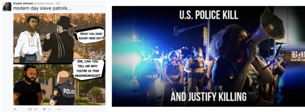
Fig. 6. Example memes circulated by RU-IRA accounts in the left cluster.

Figure 6 above also illustrates how the memes these accounts presented favored an uncompromising and adversarial stance towards law enforcement. The use of these charged messages and vocabulary of hashtags in conjunction with the central political tag of #BlackLivesMatter suggests an attempt by RU-IRA accounts to connect with both existing discontent and amplify it by proliferating certain meanings around the #BlackLivesMatter tag—similar to the phenomenon of hashtag drift [8].