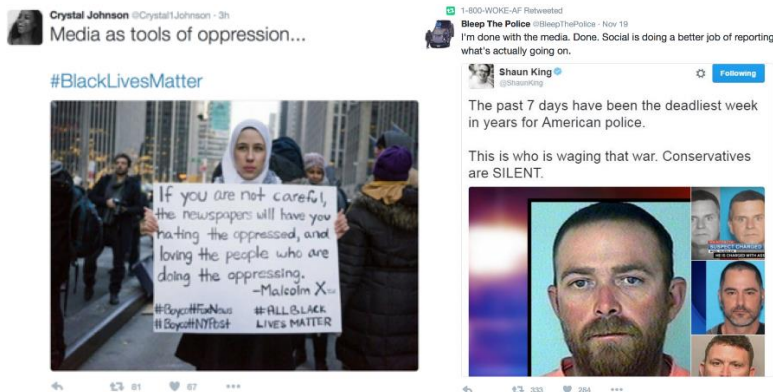
Fig. 8. Examples of ‘left’ RU-IRA tweets criticizing traditional media.

5.3.3 Converging to attack the ‘mainstream’ media: RU-IRA accounts in both clusters converged by using #BlackLivesMatter discourse and their constructed political identities to criticize the ‘mainstream media’. The @BlackmattersUS profile description and website slogan of “I didn’t believe the media so I became one” effectively summarizes this message, which was also carried forward by personal style RU-IRA accounts on the left. These accounts mixed content that A) expressed frustration with how older traditional media institutions cover issues like officer related shootings and the #BlackLivesMatter movement itself; and B) equated these long-standing institutions with tools of oppression. Figure 8 illustrates more and less direct versions of this message. The second tweet in this example shows @BleepThePolice (boosted by another RU-IRA account) repurposing a message by @ShaunKing to hold up social media as a viable alternative to “the media”.