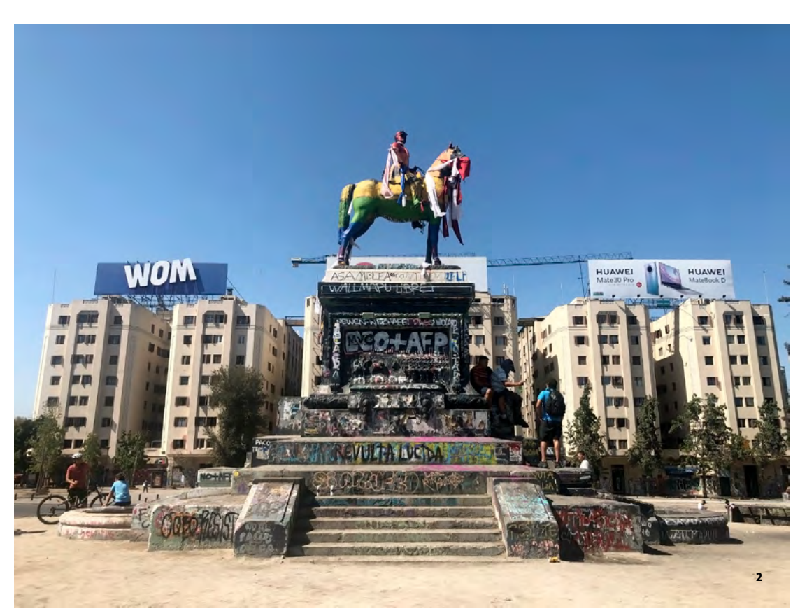
FIG. 1 La estatua de Edward Colston cae en Bristol, Inglaterra, el 7 de junio de 2020. Edward Colston Statue falls in Bristol, England, on June 7, 2020.

Considering both events, in the debate on this issue of ARQ we asked: should monuments resist in place? Or is it preferable to protect them by removing them from the public space? What happens if their meaning changes? Are they still considered monuments? What is it that resists in them? After all, if monuments materialize the intersection between history, architecture, and the city, what can resist the most, their meaning or their material?