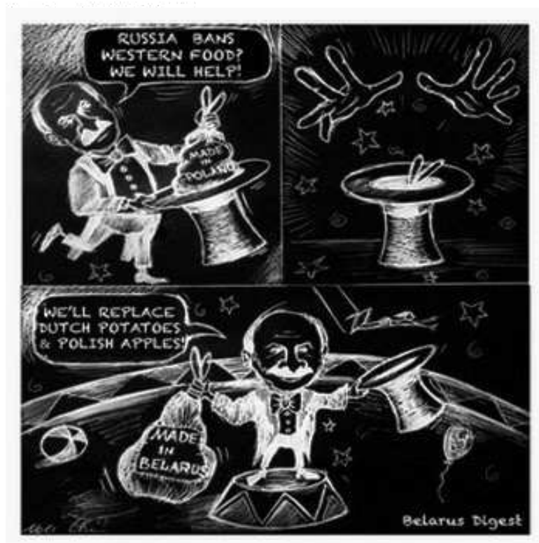
Figure 5 An ironical illustration of how Belarus supports Russia after the Russian food embargo of certain western foods.

BelarusDigest, 2014 ( http://belarusdigest.com/cartoon/ cartoon-russia-bans-western-food-we-will-help-18879 )