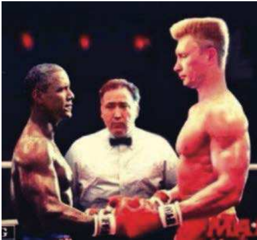
Figure 1 An example of the Internet meme that compares Vladimir Putin and Barack Obama to the characters of Rocky IV (1985).

Curiously, during the 2011-12 anti-government protests in Russia, many memes from the Facebook resistant groups, transferred to the offline posters of the activists in Moscow and St Petersburg. This example shows that, when