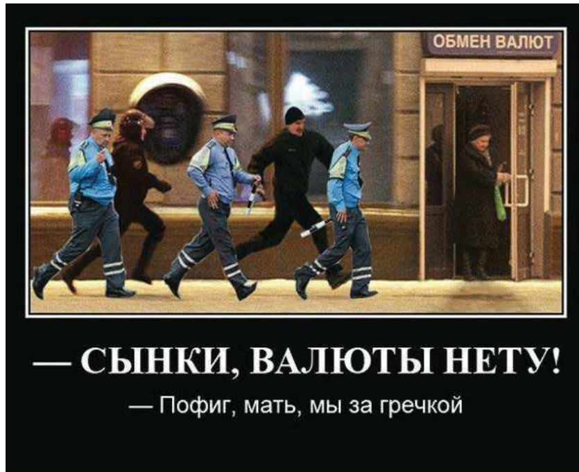
Figure 4 An example of the internet meme that plays on shortages of foreign currency and deficit of buckwheat in 2011 in Belarus. http://kyky.org/life/istoriya-belorusskoy-valyutnoy-fotozhaby