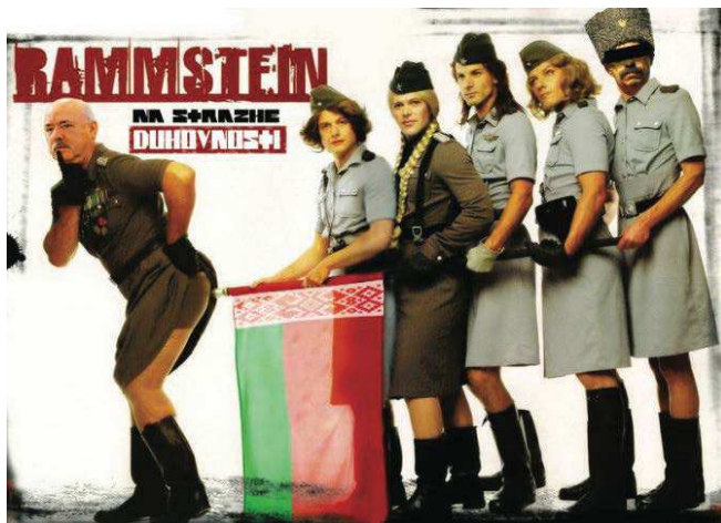
Figure 3 An example of the internet meme that uses a Rammstein album cover. Posted on Lipkovich’s blog, 2011 ( http://lipkovichea.livejournal.com/ )

Nevertheless, subversive tactics online can be employed by various actors. Similar to the Crimean incident, also in Belarus, Internet memes have become one of the wider spread non-hegemonic tactics due to the ease and relative safety of their production and dissemination. The circulation of these online grassroots satirical images explicates the difficulties involved in controlling information flows online. This is partially due to the impossibility of exerting control over “multiple” readings of the satirical messages. Three examples below contextualize challenges to authoritarian governments seeking to maintain control over media output and reception.