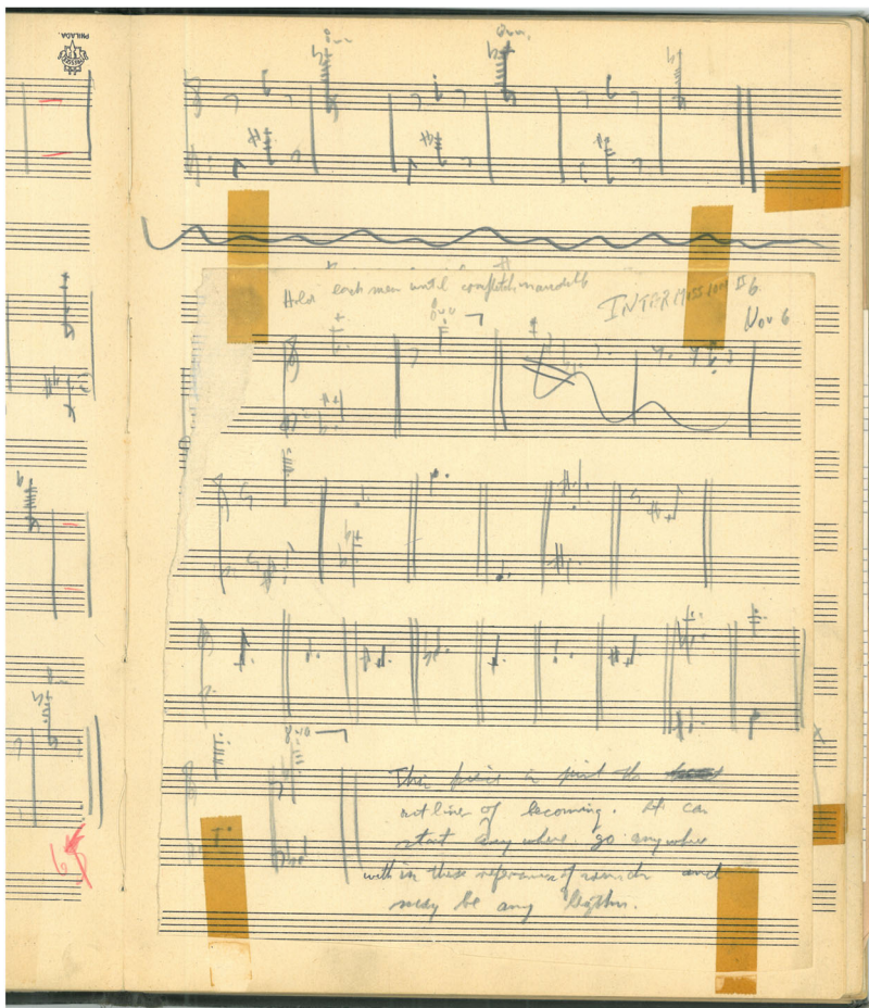
Figure 1 Morton Feldman, Intermission 6 , first version. Skizzenbuch 3 . Morton Feldman Collection. Paul Sacher Stiftung. Used by permission.

Feldman's spatialised conception of the piece is a far cry from its original notation in Skizzenbuch 3 as well as the second iteration held in the Tudor archive at the Getty. Most interesting is the instruction that accompanies the notation: 'THIS PIECE IS