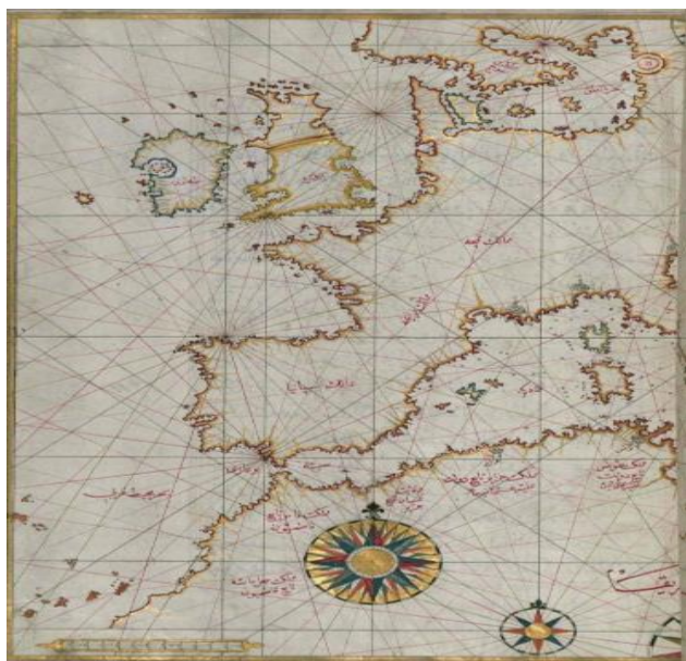
Figure 2: The Map of Europe from Piri Reis, “Kitab-ı Bahriye” second version, 1525-1526. Manuscript copied in 17th century, İstanbul University Library, İstanbul (T. 6605).

The book called Kitab-ı Bahriye 4 (Book of Navigation on Mediterranean Coasts) gives a lot of key information about the Mediterranean Sea, cities and towns on the Mediterranean coast and islands with illustrations and text on navigation and seafaring. Piri Reis first wrote Kitab-ı Bahriye in 927 AH/1520-1521 CE and then added other parts of book in 932 AH/1525-1526 CE.