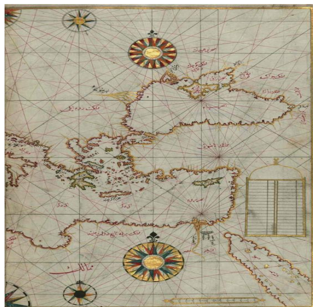
Figure 3: The Map of Europe from Piri Reis, “Kitab-ı Bahriye,” second version, 1525-1526. Manuscript copied in 17th century, İstanbul University Library, İstanbul (T. 6605)

In a specific chapter of Kitab-ı Bahriye, Piri Reis says that he abided by the internationally approved map cartography traditions of his time. Cities and castles are shown by red stripes, desolate places by black stripes, debris and giblets by black points, shallows and sandy places by red points and secret rocks by crosses.