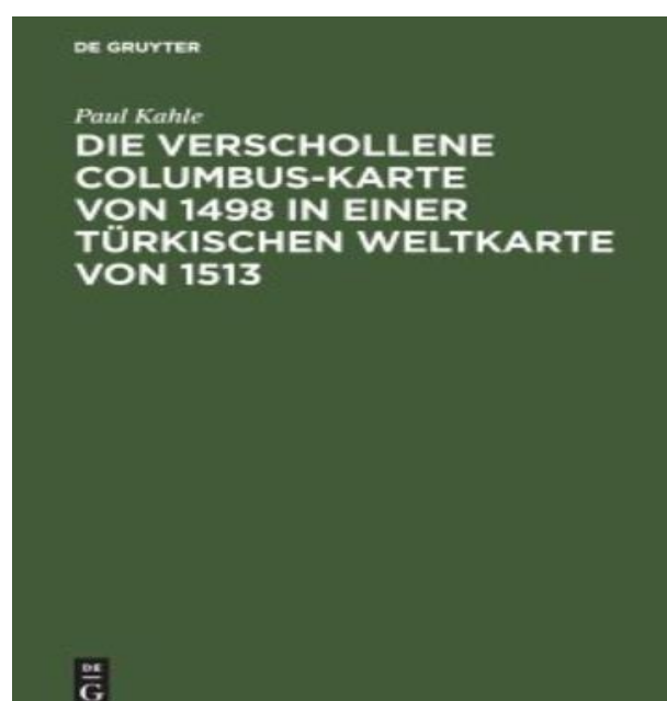
Figure 1: Die Verschollene Columbus-Karte von 1498 in einer Türkischen Weltkarte von 1513 (The Lost Map of Columbus, 1498. In A Turkish General Chart of 1513). by Paul Ernst KAHLE. (Walter de Gruyter & Co., Berlin and Leipzig, 1933, 52 pp. 9 facsimile charts.)

Even though Pîrî Reis who read these developments and technical supremacy of Portuguese ships well, made some technical and scientific points for renewing and developing Ottoman fleet in this area, in 1554, by order of Kanuni Sultan Süleyman first he was expropriated and then he was executed in Cairo being a victim of various plots. It is undoubtedly obvious that Muhyiddin Pîrî Reis, lived guessingly for about 85 years, had gave important service to Ottoman navigation and world history of cartography.