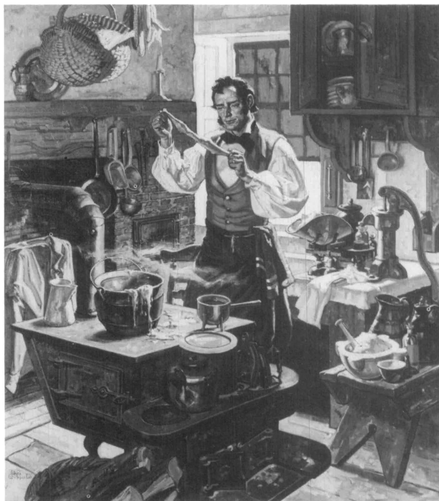
In 1839 Charles Goodyear discovered the vulcanization process by spilling a mixture of rubber latex and sulfur on a hot stove.

Macintosh's partner, English inventor Thomas Hancock, continued to work with raw rubber, sure that "something must eventually be done with so singular a substance." Hancock patented the idea of applying strips of rubber directly to cloth (in 1820) since his first attempts to coat fabrics with the turpentine/latex solution did not result in a satisfactory texture—and they smelled bad. Hancock also invented a machine called a "masticator" that allowed the reprocessing of scrap rubber.