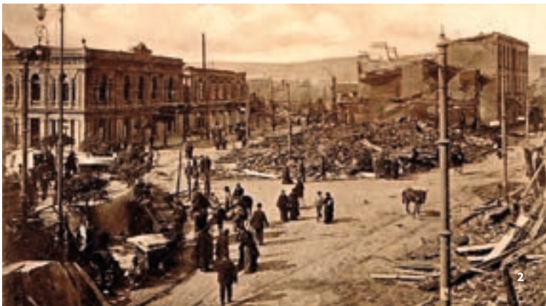
2 El Almendral luego del terremoto de 1906. Calle y Plaza Victoria, Valparaíso (Actual Av. Pedro Montt). / El Almendral after the 1906 earthquake. Victoria Street and Square, Valparaíso. (Current Pedro Montt Av.).

commonplace. However, there was also a certain degree of consensus on the general values that should inspire the 'ideal' Valparaíso, specifically the search for a more modern, more hygienic and more monumental city. In this way, catastrophe becomes an opportunity to redesign the urban space, creating a 'window' through which the urban values of a society can more clearly be observed (Healey, 2011).