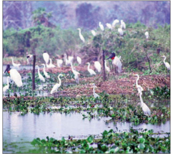
Figure 5: A marsh alongside the Paraguay River with egrets, spoonbills, ibises and Maribu storks all resting quietly. Our host's pistol shot raised a veritable cloud of marsh birds.