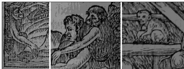
Figure 2. The monkeys of André de Thevet's Les singularitez de la France Antarctique .