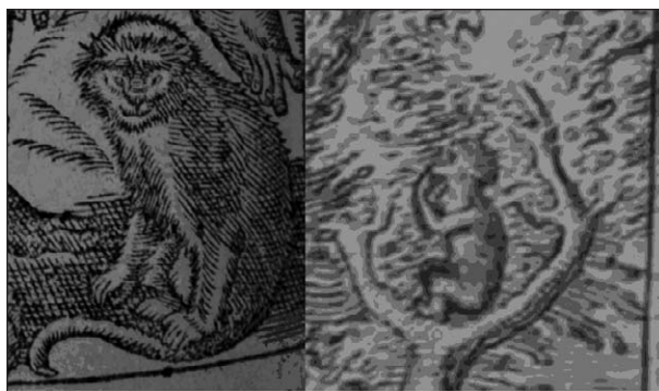
Figure 3. The monkey of the Tupinamba in Jean de Léry (1585)'s chronicle (left), and Theodore de Bry (1592, right).

This work included a review of the primates known in Europe by the first half of the XVIth century. In 1560, Gessner published his Icones animalium where the pre-Linnaean zoologist published what seems to be the first scientific representation of a Neotropical monkey. The author showed different Old World monkeys such as a baboon and a macaque, primates from the Medieval imaginary, as well as the sagoín as an illustrated primate from the Americas (Fig. 1). A brief profile of this monkey, a marmoset ( Callithrix sp.), is also presented. He noticed morpho-behavioral characteristics such as its small size, and its agile and elusive nature. Gessner used the term Galeopithecum for referring to this primate.