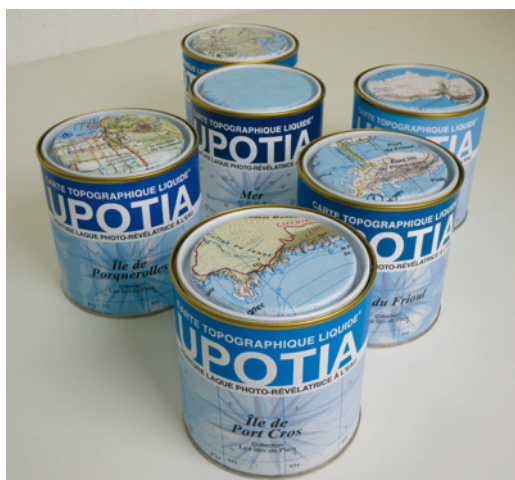
Fig. 2. Upotia: les îles de PACA, Nicolas Desplats. Mappamundi exposition, Hôtel des arts, Toulon, France, 2013. (Source: http://documentsdartistes.org/artistes/desplats/repro4-3.html . Accessed 22 Feb 2017)

The third example comes from Francis Alÿs, a Belgian artist that proposed performances in two of the most controversial borders worldwide: the US-Mexico border and the Green Line in Israel. In 1997, Alÿs was invited to join the InSite exhibition held in the San Diego-Tijuana border region. For this exhibition, Alÿs prepared a performance called The Loop : his purpose was to travel from Tijuana to San Diego without crossing the US-Mexico border. In order to accomplish this long and expensive journey, Alÿs did a circumnavigation around the Pacific Ocean (figure 3). His itinerary comprised the following cities: Tijuana, Mexico City, Panama City, Santiago, Auckland, Sydney, Singapore, Bangkok, Rangoon, Hong Kong, Shanghai, Seoul, Anchorage, Vancouver, Los Angeles, and finally San Diego. With this performance - an extravagant and wasteful trip - Alÿs criticizes the economic and political obstacles that Mexicans are facing. Therefore, crossing that border is privilege that is allowed only for few people.