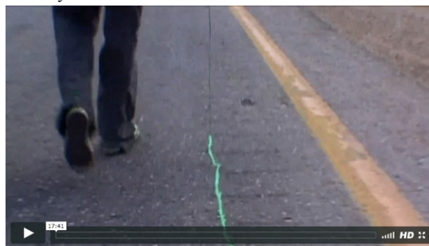
Fig. 4. The Green Line , Francis Alÿs. Jerusalem 2004.

drawn by a military commander, using a green pencil on a map (Harmon & Clemans 2009), and it separated some disputed Palestinian territories in the West Bank. This demarcation had an extensive impact in local population. From both sides, their lives were affected by administrative, cultural, religious and security issues. Although that demarcation line was officially removed some decades later, its effects are still present. Since then, the line became a clear example of how an artificial decision on a map could impose power relations over a territory.