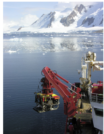
Figure 1. The Isis ROV being deployed from RRS James Clark Ross.

The rate of phytoplankton production during spring and summer blooms can, however, sometimes be so great that it exceeds the rate of consumption by grazers in the shallows of the watercolumn. Observations elsewhere in the global ocean have shown that heavy falls of 'marine snow' — dead and decaying plankton remains sinking from the surface — coincident with the surface phytoplankton bloom provide an important pulse of food to the otherwise impoverished deep sea environment [9]. The 'snow' particles can accumulate to depths of several mm on the seabed before biodegrading. Clark and Tyler [2] observed krill nose-diving into the seabed in a behaviour that resuspended particulate matter, which the krill then ate. The authors suggest