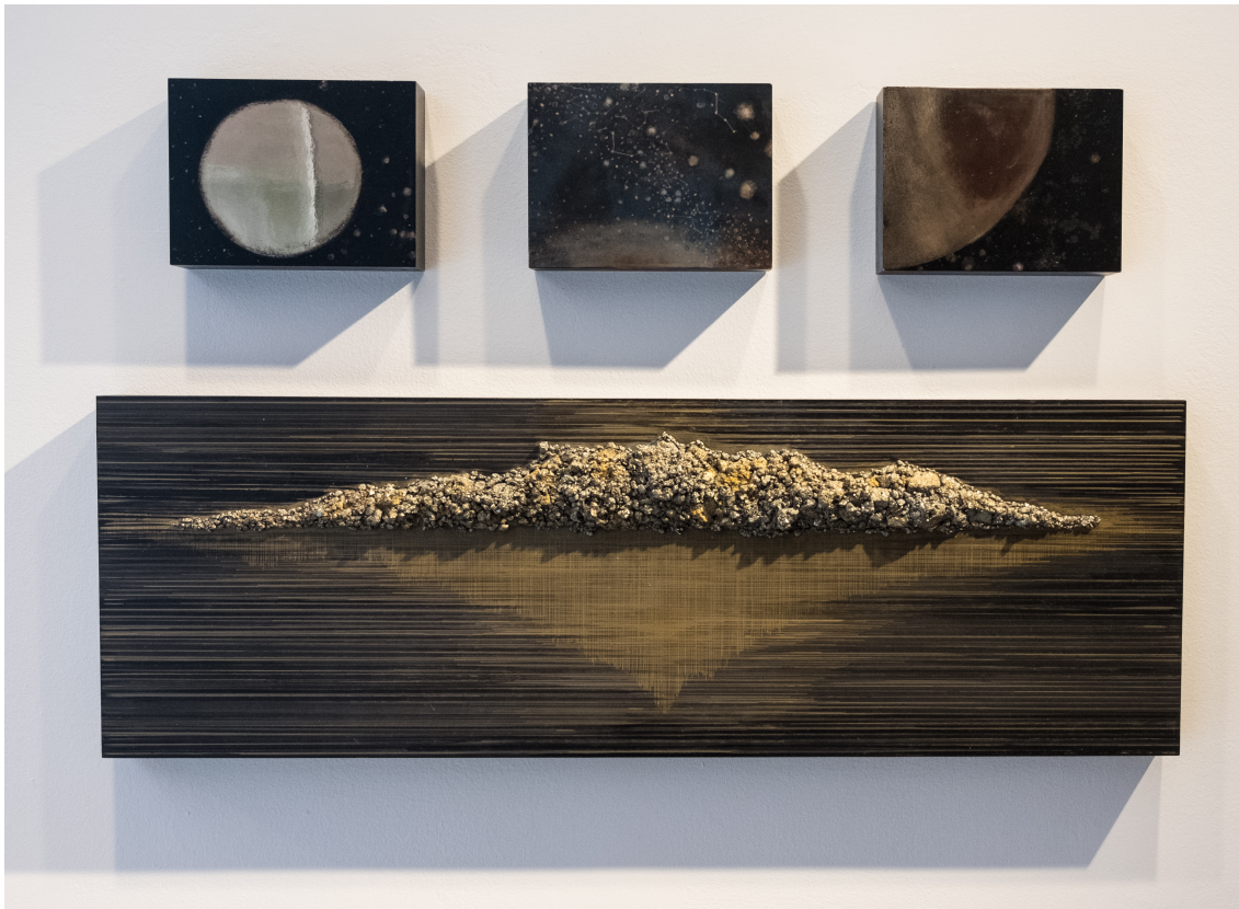
Figure 3 Teresita Fernández, Aponte , 2017; pyrite, oil, and graphite on wood panel, 21.5 x 36 x 2 in. overall (courtesy of the artist and Lehmann Maupin, New York; photograph by Yolanda Navas).

And as Renée and Ferrer pondered this, something simple and obvious became vividly apparent—Aponte loved his book. He could not destroy it; he protected it.