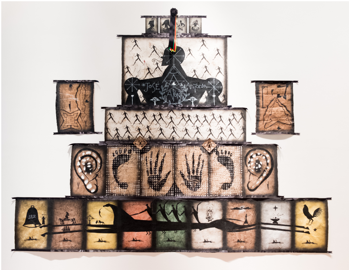
Figure 2 José Bedia, Júbilo de Aponte , 2017; mixed media on mixed papers, 106 x 143 in. (courtesy of the artist).

from Aponte's burdens as a leader of a weighty, treacherous struggle for black freedom. Fernández's interpretation is novel, and it derives, in part, from her reading as an artist the words of Aponte the artist (see fig. 3). We might even say it derives from a synergy between her own artistic and political practice and Aponte's.