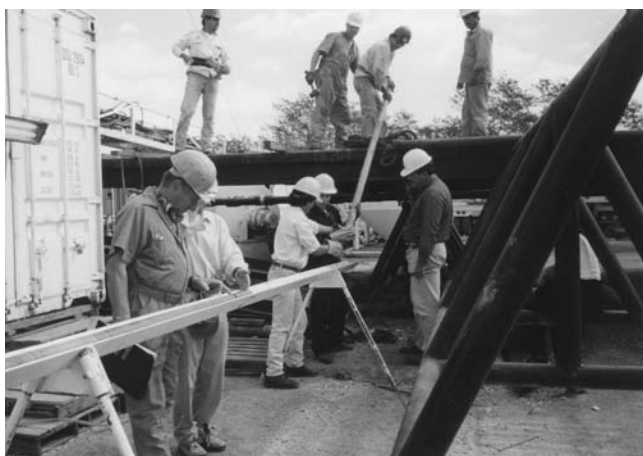
Fig. 2a. Drilling operations at Hacienda Yaxcopoil.

an automated digital core scanner were available for documentation. Cores were transported from the drill site daily, and information was made available on the CSDP web site through the ICDP information system. After completion of drilling operations, cores were packed and shipped to the UNAM Core Repository in Mexico City. Cores were further examined and then cut longitudinally in halves (one half is the project archive, while the other one is available for sampling