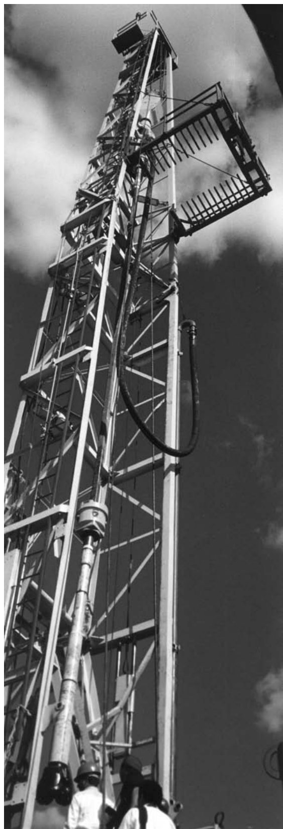
Fig. 2b. The CSDP rig at Hacienda Yaxcopoil.

has been proposed in Dressler et al. (2003) and in other papers included in these volumes (e.g., Tuchscherer et al. 2004; Stöffler et al. 2004). The Cretaceous sedimentary rocks below about 895 m are cut with dikes of polymict breccias and display zones of monomict brecciation. They appear to represent “megablocks” displaced by the impact event. Anhydrite layers, the thickness of which varies from a few centimeters to up to 15 m, and make some 27% of the megablocks. Organic-rich layers and oil-bearing units are present at depths between 1410 and 1455 m (according to Kenkmann et al. [2004], this layer starts at 1263 m.).