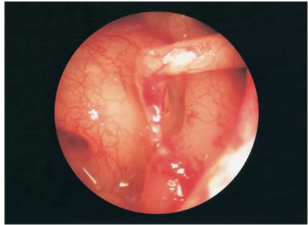
Figure 4. A digital photograph, using a 4-mm sinus endoscope, of the middle ear in preparation for a stapedectomy. The stapes, oval window, stapedial tendon, fallopian canal, and Jacobson nerve are well visualized.

28 (Table 1) were all otologic pictures ( Figure 4 ). The picture quality of the 35-mm images was uniformly poorer than that of the digital photographs. Even though the digital photographs matched or exceeded the 35-mm images, all of the digital images lacked significant depth of field. This may explain the excellent picture quality in the middle ear, where depth of field is limited by anatomic features. The lack of depth of field in the other photographs can be explained by the shutter size needed for clear images and the distance of the camera from the endoscope.