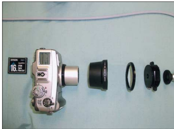
Figure 1. Digital endoscopic equipment (from left to right): CompactFlash card, camera (Canon Power Shot G2 4 Megapixel camera; Canon USA, Lake Success, NY) with lens fully extended (normal operation), lens adapter, step-down ring, endoscopic adapter, and endoscope. A fiberoptic light cord is running along the top of the photograph.

One camera (Epson PhotoPC 3000Z 3.3 Megapixel camera; Epson USA, Long Beach, Calif) met the initial criteria for purchase. A lens adapter is shipped with the camera, which allows the endoscopist to use Epson USA or third-party lenses and filters to modify images. If lenses or filters are attached directly to the camera housing, the lens mechanism will not fully extend. Most midrange digital cameras with a zooming capability have a retractable lens that retracts into the camera body when the unit is off. During normal operation, the lens is fully extended, hence the need for the lens adapter that fits like a sleeve over the extended lens ( Figure 1 ). The lens adapter shipped with the camera has a 46-mm step-up to a 49-mm thread. Initially, a borescope adapter (item STI10213; Scope Technology, Pomfret, Conn) was purchased. The endoscopic adapter can be purchased in a 46- or 37-mm thread. Because the 46-mm thread more closely approximated the 49-mm thread, it was purchased. To accommodate for the change from 46 to 49 mm, a 49- to 46-mm step-down ring was purchased at a local camera store (widely available). The final adaptation in linear form was as follows (final thread in millimeters): camera (Epson PhotoPC 3000Z 3.3 Megapixel camera) (46 mm) → lens adapter (49 mm) → step-down ring (46 mm)