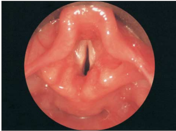
Figure 3. A digital photograph, with a 10-mm 0° endoscope, of a healthy pediatric larynx.