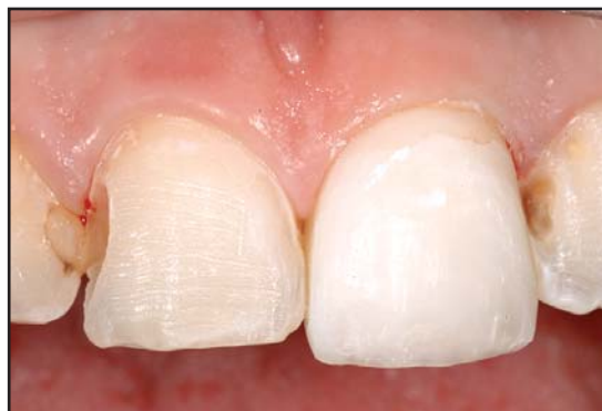
Figure 7. A basic shape is formed with a finishing diamond bur. The critical part is achieving a proper position and cant to the midline and a suitable tooth width.

The digital images were loaded onto the computer, scrutinized, and marked with needed changes (Figure 9).