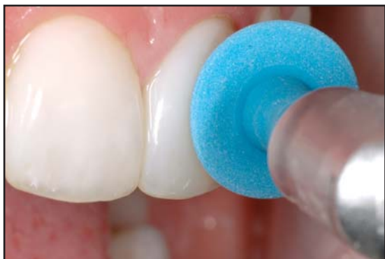
Figure 14. Rubber polishing disks are then used to finish the polish and to enhance developmental grooves on the facial and incisal characteristics.