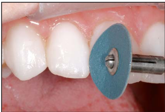
Figure 12. Flexible sand paper disks are used to shape embrasures between teeth and for basic tooth contouring.