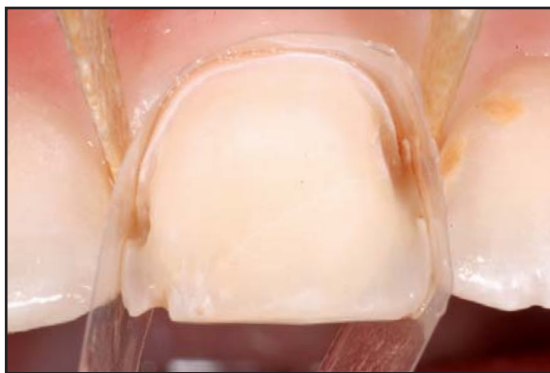
Figure 3. Decay, composite, and surface stains are removed, and the entire surface is roughened with a diamond bur. A contour matrix is placed and very lightly wedged.