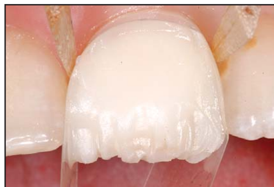
Figure 5. The enamel microfill composite is placed with a plastic instrument and shaped with a composite roller after the flowable composite.

The first composite resin layer (ie, Renamel Universal Hybrid, Cosmedent, Chicago, IL) formed the foundation of color within the restoration (Figure 4). Shade A3 was placed in the formerly decayed interproximal areas and on the incisal edges where length was to be added. It was undercontoured by 1 mm in all areas so that the layer would not extend through the final enamel layer