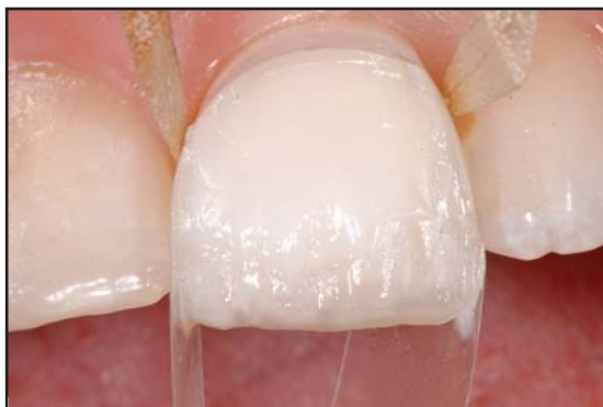
Figure 6. Low opacity incisal shade is added and shaped about 1 mm longer than the final desired length to allow for anatomy development and polishing, and is then cured.

after finishing, and then cured for 20 seconds. The enamel layer was initiated with the placement of a flowable composite along the gingival aspect of the matrix and followed with a bleach-shade (SB3) composite. The noncured flowable composite reduced voids and was mostly forced out as the more viscous enamel material was placed. The incisal edge was made irregular with the edge of a plastic instrument or explorer and left 1 mm to 2 mm from the desired final edge length, and was then cured for 20 seconds (Figure 5). The key was that the indentations were varied in width and length, so that the incisal shade blended naturally into the enamel without abrupt transition areas. A transparent incisal shade of flowable composite was followed by incisal-shaded composite that was shaped and cured (Figure 6).