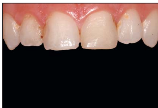
Figure 2. Decay and composite material must be completely removed prior to composite placement.

Incisal shades are strategically used in small amounts to mimic translucency and incisal characterization or to enhance the surface of the entire restoration. Since these composites have little opacity, they cannot be used to conceal a color or transition area. If used properly, however, they will give the restoration a natural appearance. Enamel composites basically fall between dentin and incisal in terms of opacity and their ability to mask color. They form the majority of the facial surface of the tooth and are used to form the basis of the final desired tooth shade. Their color intensity is influenced by the thickness of the resin layer and by any color that might be underneath it. The thicker it is—this also applies to dentin shades—the more intense and consistent its final shade will be. These are the basic components necessary for the clinician to create highly aesthetic composites using a direct layering technique. While varying tints and customization materials are often needed when matching a single tooth, they are seldom required for a complete veneer case.