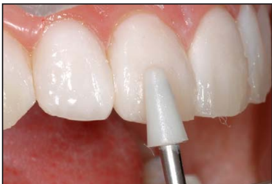
Figure 10. The composite roller makes smoothing and contouring final layers very efficient.