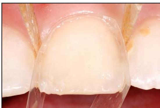
Figure 4. The areas of missing tooth structure interproximally and incisally are replaced with a microhybrid matching the existing dentin shade.