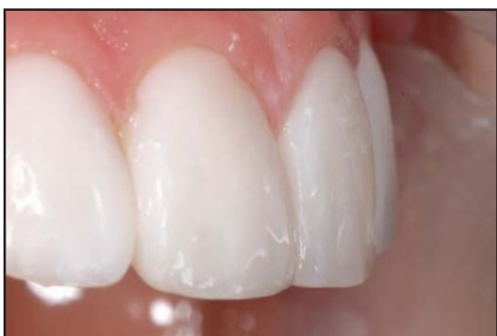
Figure 11. Care is taken to keep anatomy on the facial surface during contouring and polishing.