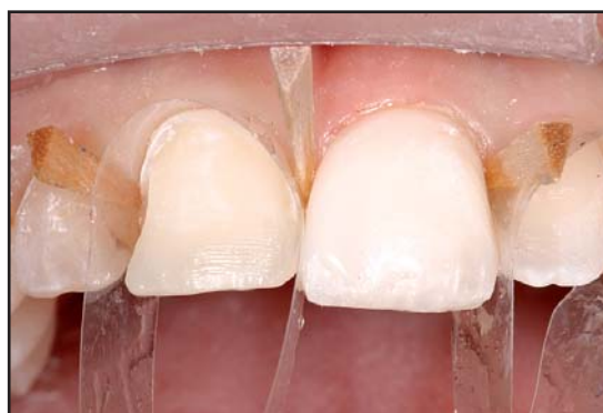
Figure 8. The neighboring teeth can then be completed using the same techniques as before.