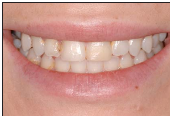
Figure 1. The lip line covered all of the gingiva except for the points of the papilla. Both porcelain and composite veneers were offered to the patient.