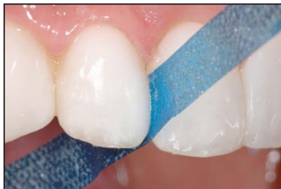
Figure 13. Interproximal surfaces are then contoured and smoothed with a #12 blade and finishing strips.

At the three-day follow-up appointment, the veneers were evaluated for areas that were rough, sharp, or unable to be flossed. Phonetics were also used to determine if the incisal edge position required adjustment. The patient was shown the images taken from the placement appointment and decided to have the second premolar veneered