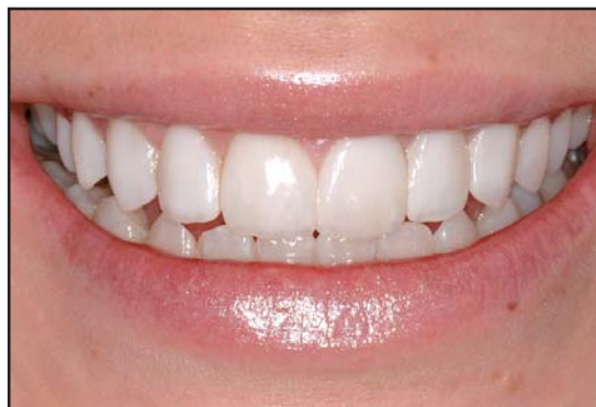
Figure 16. By using various opacities and colors, the veneers cover all of the decayed and broken down areas and the new surface color is consistent and natural.