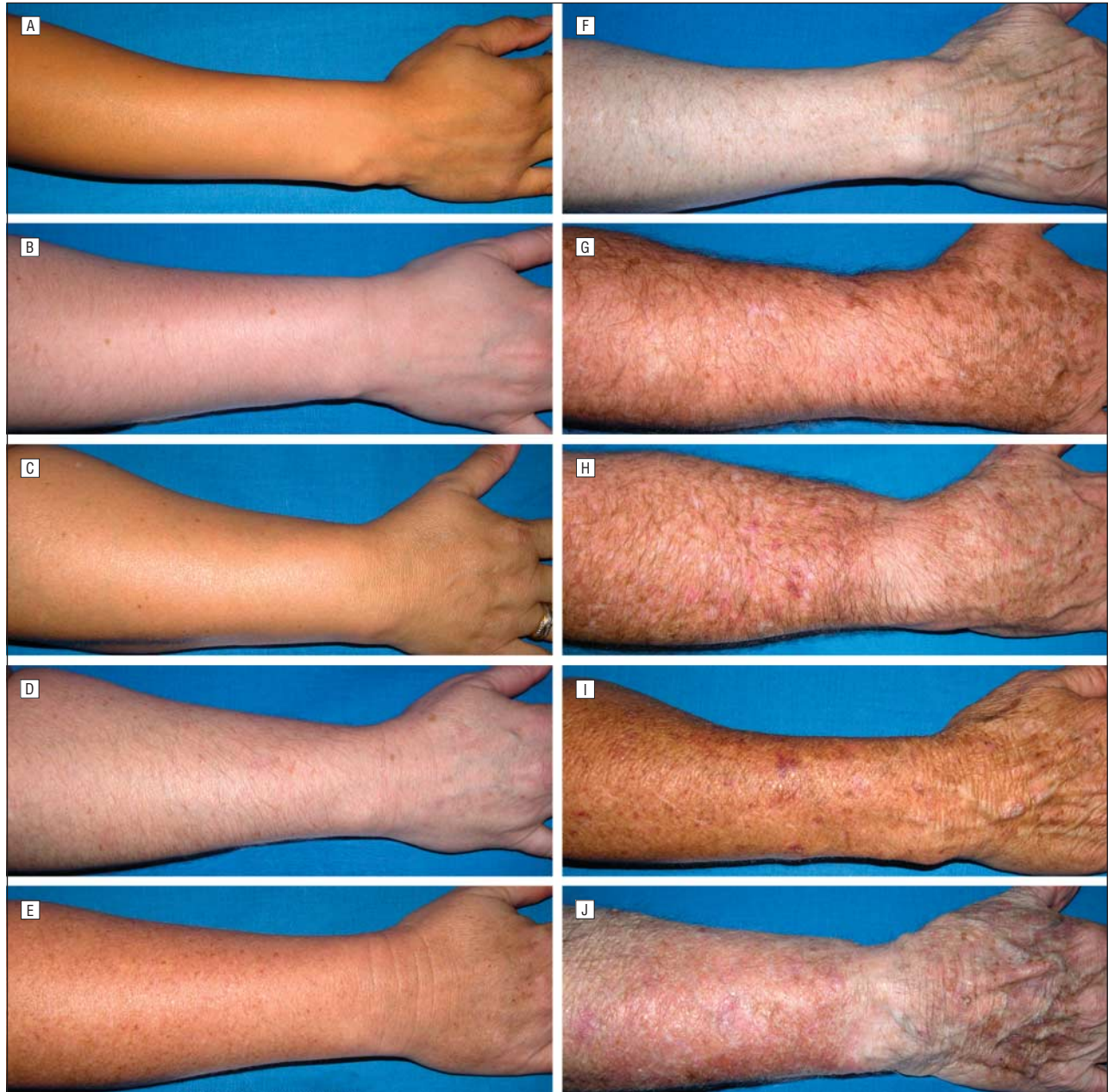
Figure 3. Global assessment: severity score 0 (A); 1 (B); 2 (C); 3 (D); 4 (E); 5 (F); 6 (G); 7 (H); 8 (I); and 9 (J).

face. On assessment of interobserver agreement, chance-corrected \kappa scores ranged from 0.44 to 0.76 on the first and second occasions. In addition, dermatologists with and without experience with sun-damaged skin scored similarly, supporting the notion that a photographic scale increases objectivity and standardization. Testing of our scale achieved similar or better interobserver agreement using blinded image sets. Figure 3 shows the global assessment photographs with the best agreement.