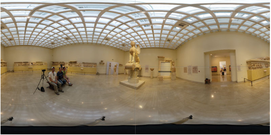
Figure 5. Stitched CAVEcam imagery from one camera of the Sphinx of Naxos.