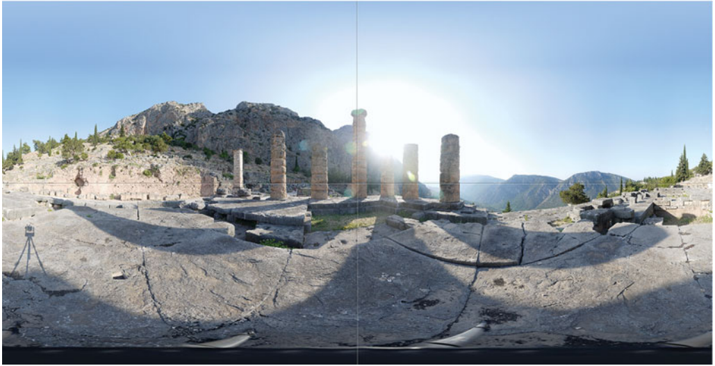
Figure 3. Stitched CAVEcam imagery from one camera of the Temple of Apollo.