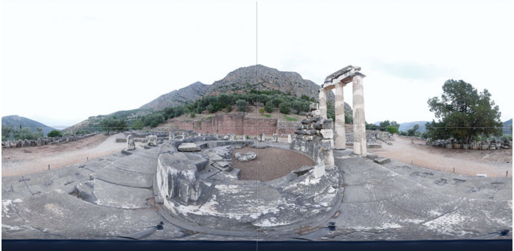
Figure 4. Stitched CAVEcam imagery from one camera of the interior of the Tholos.