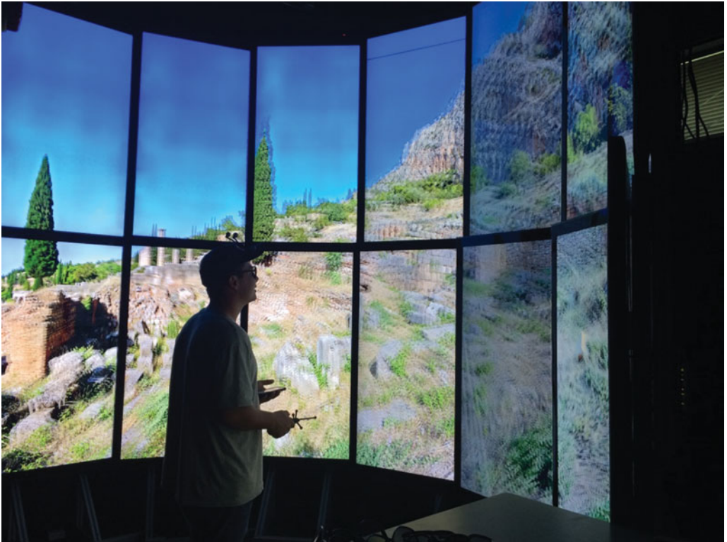
Figure 6. CAVEcam of Roman complex in the Qualcomm Institute, UCSD.