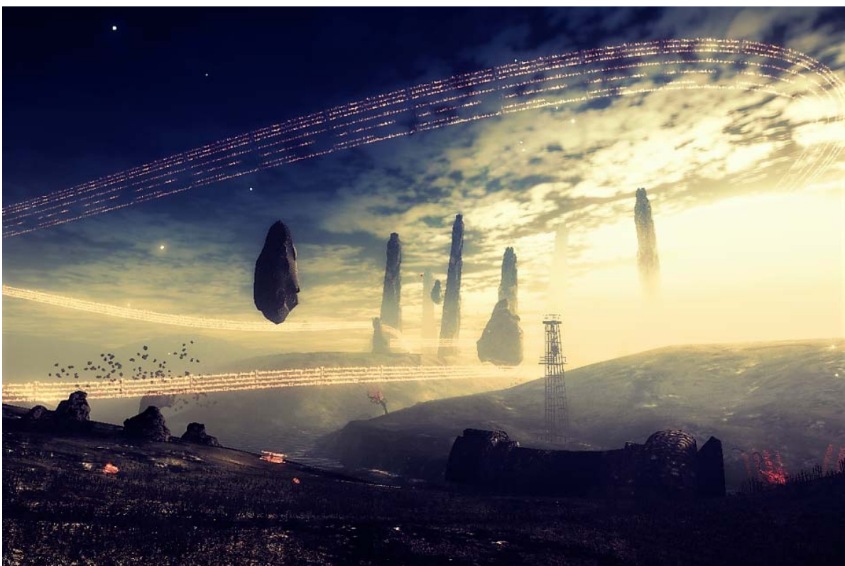
Fig. 4. A screenshot of Mez Breeze and Andy Campbell's All the Delicate Duplicates .

¶ 35 Duplicates is as beautiful as it is technically impressive, and it signals how artists like Breeze and Campbell are drawing electronic literature in from the outskirts of the canon—this work has received mainstream accolades. Among other awards, it won the 2015 Tumblr International Digital Media Prize, and it was an official selection at the 2015 Showcase Parallels Freeplay Independent Games Festival, as well as a finalist for the 2014 BBC Writersroom / The Space Prize for Digital Theatre.