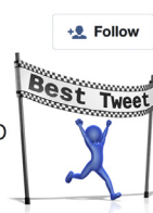
Figure 5. Tweet by Jeff Riddell, MD.

Barrier to tech/SoME: We need good prospective studies with sound methods to show that what we think is better really is better #aliemrp