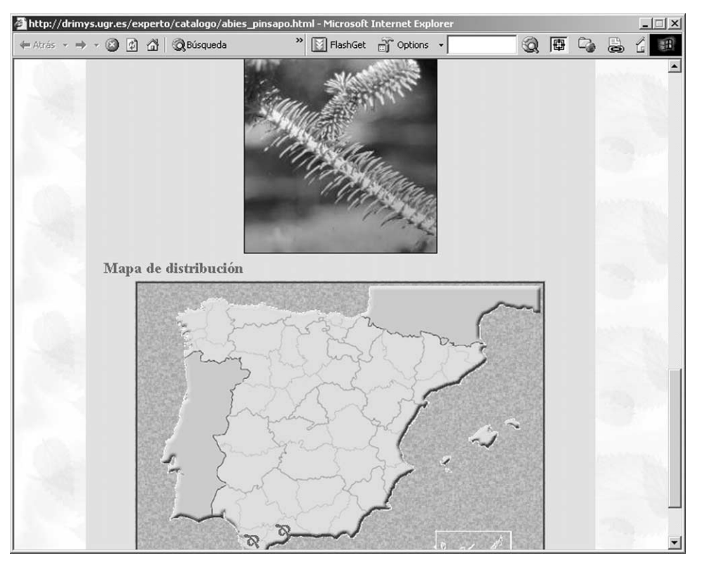
Fig. 4. Other screen shot for the user interface for additional information. Author: Eva Lucrecia Gibaja Galindo.

factors is clear. In the advanced mode, the user must manually enter the certainty value of the observation.