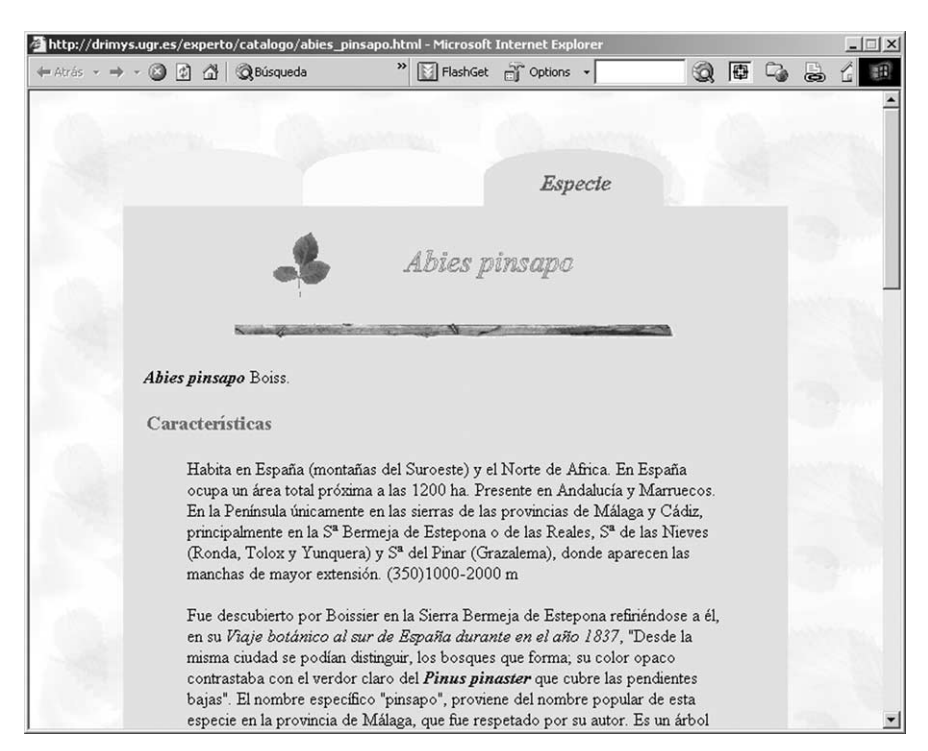
Fig. 3. A screen shot for the user interface for additional information. Author: Eva Lucrecia Gibaja Galindo.