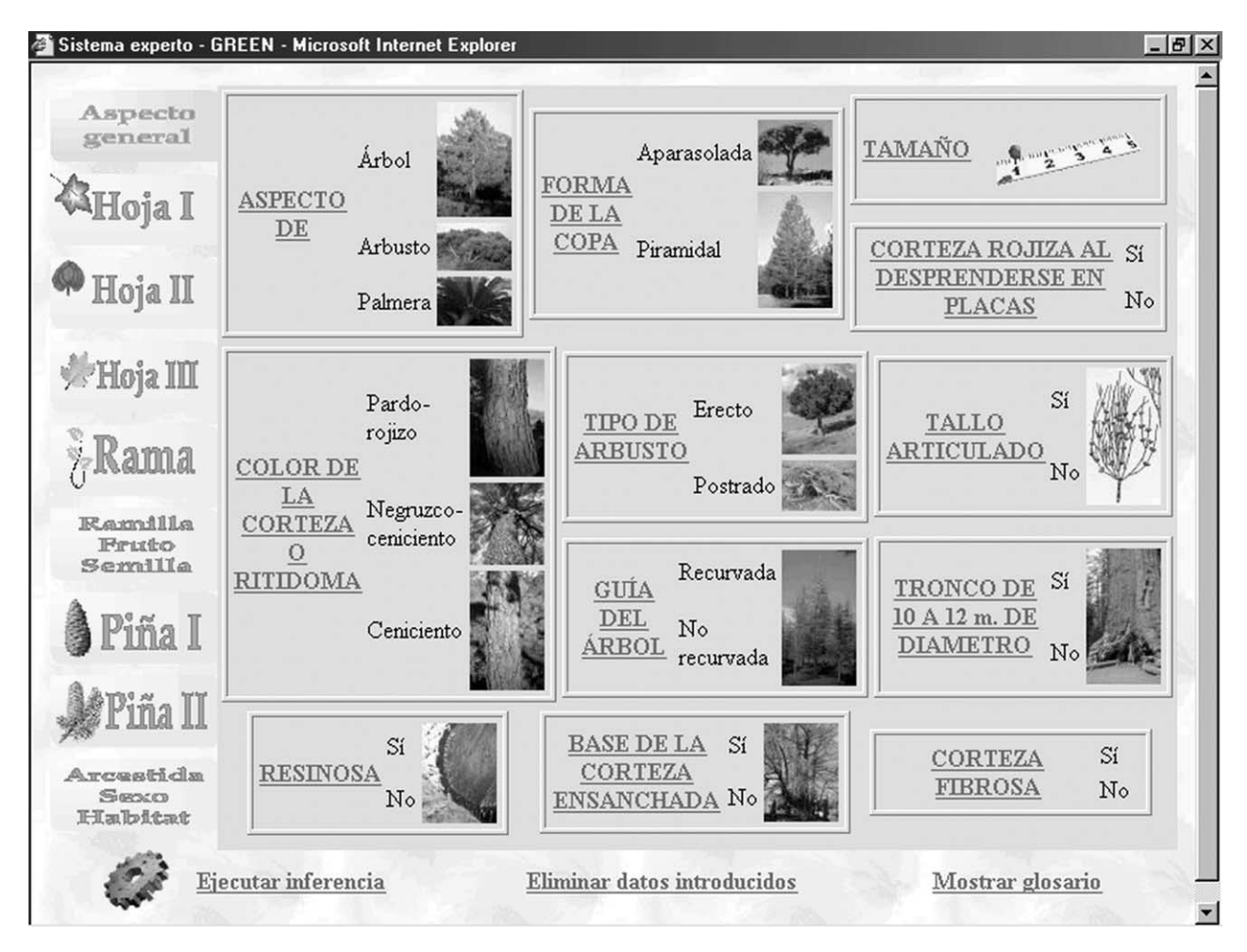
Fig. 1. A screen shot for the user interface for introduction of data. Author: Eva Lucrecia Gibaja Galindo.

The System has been provided with two methods for entering the query: basic and advanced. In the basic mode, the user has a set of options, so that the use of certainty