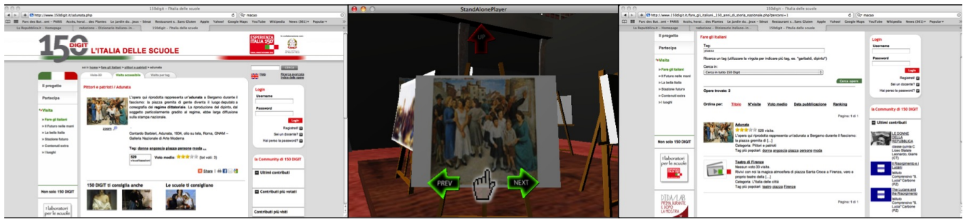
Figure 1: The visit modalities in 150 Digit. Left, standard hypertext; center, 3D visit; right, tag-based visit.

Different types evaluations were carried out by the project team at different stages of development. In the system design stage, and in particular during the requirement elicitation, a focus group of 5 users, 4 males and 1 females, aged 40-62, was selected. The participants were shown to a set of 15 scenario based static interfaces and the main systems functionalities, labeling and layout with the designers, for 3 hours. In general this group of teachers highlighted the need for textual content to be associated to the exhibits, and for dedicated tools for content creation. They appreciated the proposed interfaces/functionalities, and considered them as valid tools for classroom work and students' involvement. The main findings emerged from the focus group affected the project with changes in both labeling (e.g., "favourites" instead of "playlist") and functionalities. In particular, some of the existing functionalities were modified (for example, teachers suggested to show tag recommendations only on request), and new ones were added: mainly, the possibility of creating a virtual class where students can discuss the exhibits and insert comments that are visible only within this class.