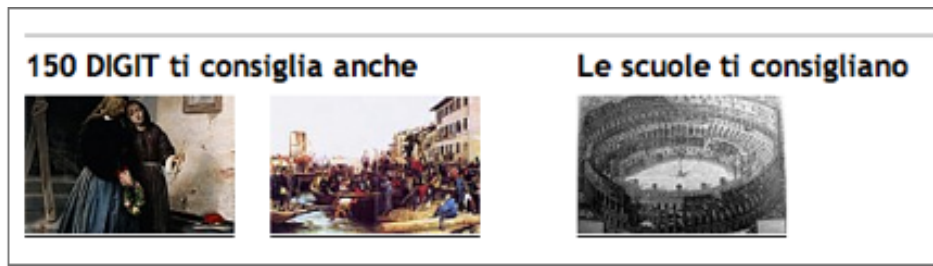
Figure 4: Content recommendation in 150 Digit. On the left, the tag-based recommendations (“The systems recommends you”); on the right, the preference-based recommendations (“Schools recommend you”).