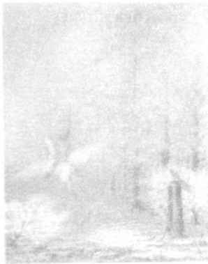
FIG. 1. BEHIND THEM A ... ANALYSIS