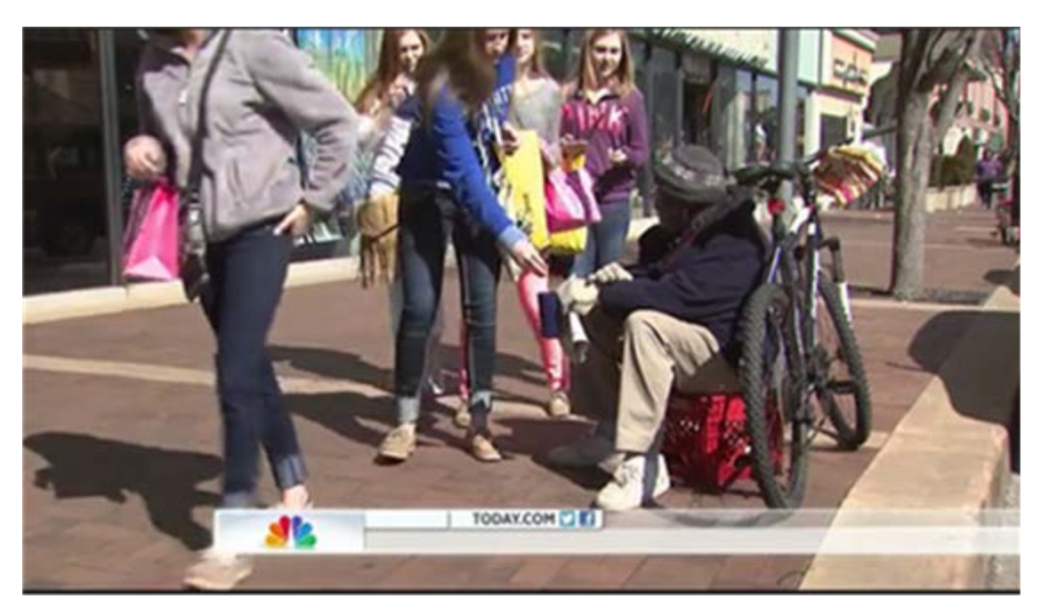
Figure 7.2: Screen capture from Today on September 1, 2013 showing Harris panhandling on the streets of Kansas City, MO.