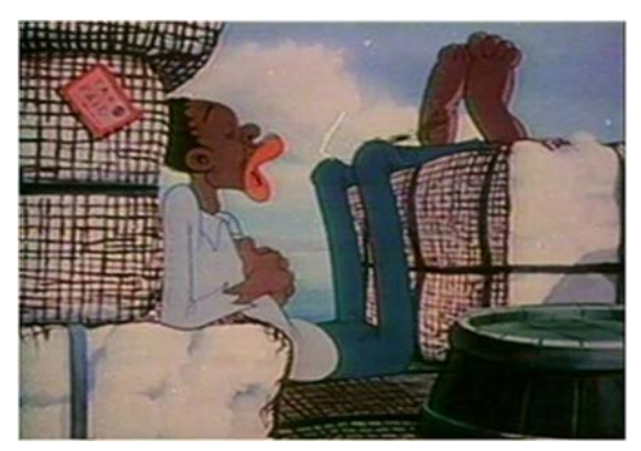
Figure 6.3: Cartoon still from "Scrub Me Mama with a Boogie Beat" Universal 1941.