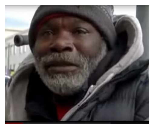
Figure 7.1: Screen capture close up of Harris. Similar image used in all articles.