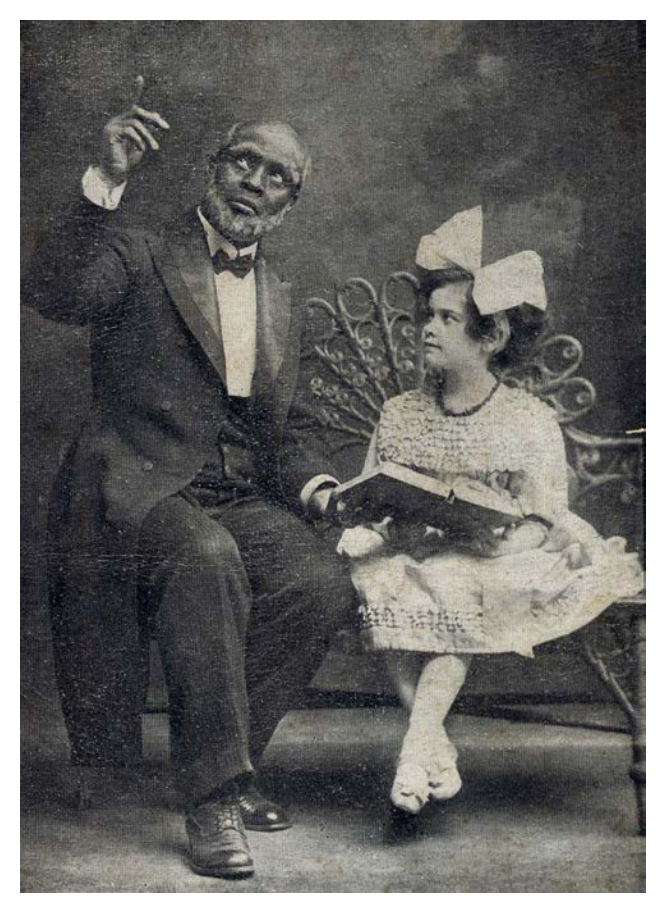
Figure 7.3: Photo card of Uncle Tom and Little Eva from Stetson's Uncle Tom's Cabin, ca. 1890s.