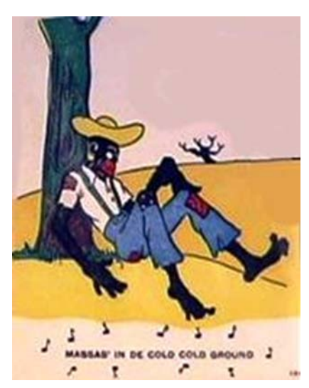
Figure 6.2: Postcard of a slave singing Stephen Foster's 1852 minstrel song.