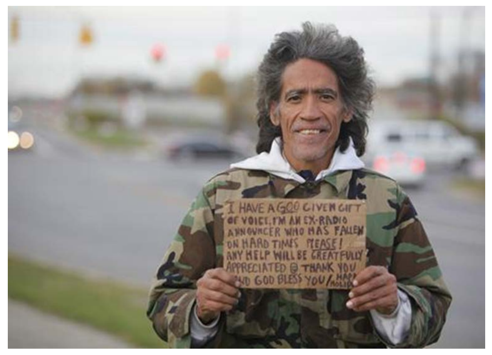
Figure 5.1: Image of Ted Williams by Doral Chenoweth III.