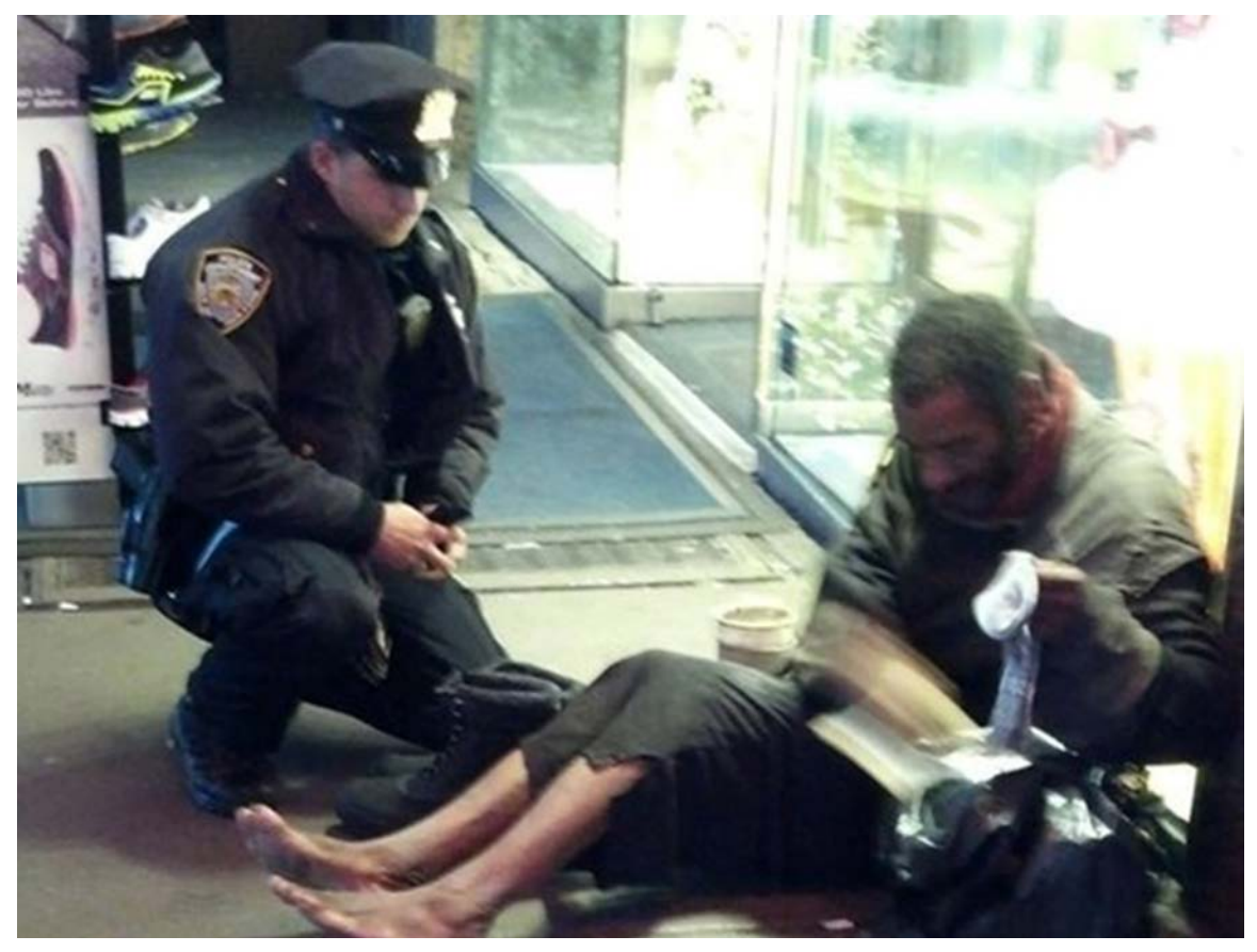
Figure 6.1: Original image taken by Jennifer Foster in November 2012 and posted to the NYPD Facebook page that subsequently went viral.