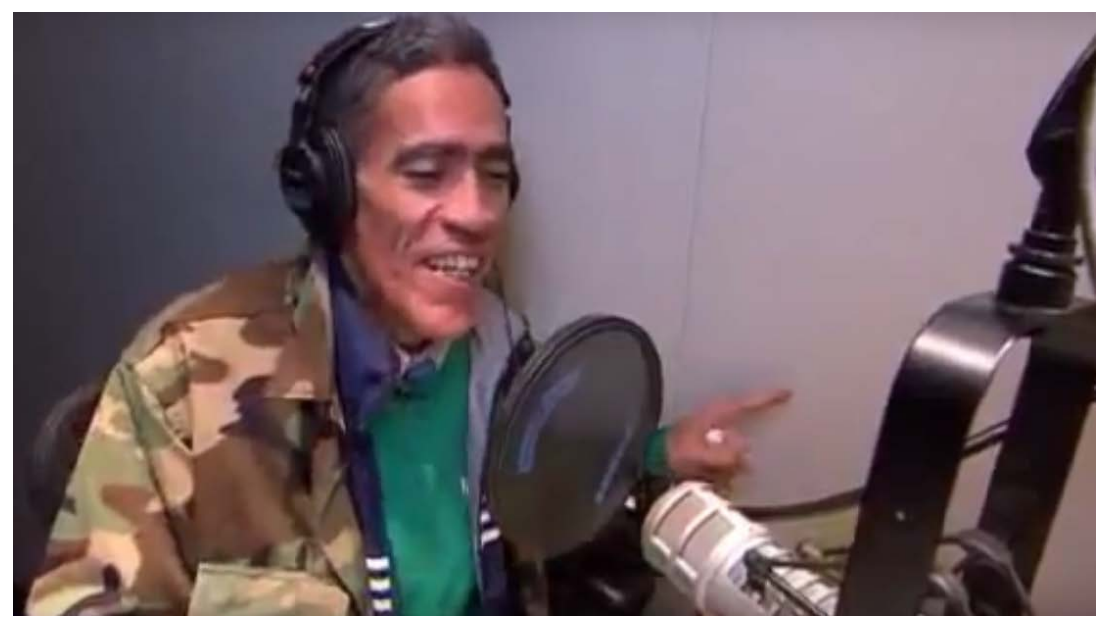
Figure 5.2: Screen capture of Williams doing the opening for Today on January 6, 2011.