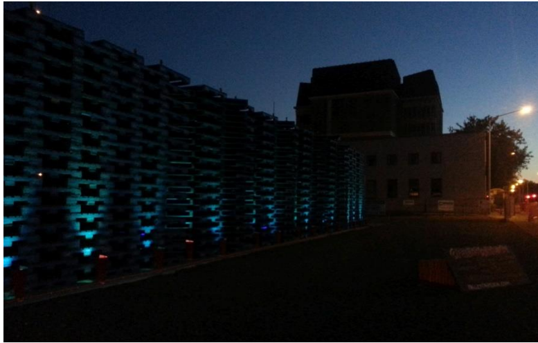
15: The Pallet Pavilion at night (January 2013)

took place in canvas marquees. 402 But the Pallet Pavilion faced some unique challenges during its operating life.