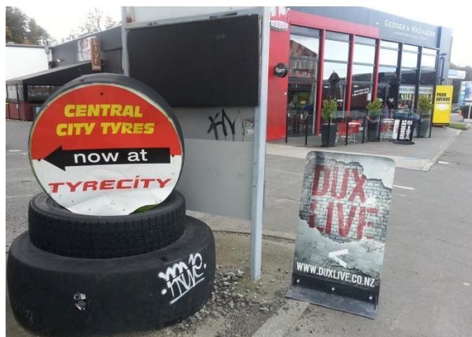
9: Dux Live! street frontage, Addington (April 2014)

Even though Sinke acknowledged that the new venue would not be able to replicate the beautiful garden setting and ornate details of the original Dux de Luxe, keeping the heritage of the Dux name alive was the goal. 314 Herrick thought there were definite benefits to the new space: “The old Dux was a good little venue, though it was always a room we put music into, rather than a room built around music”. 315 The new space offered enough floor space and height to afford a mezzanine space overlooking the stage and dancefloor, a Yakatori kitchen, and the ability to take the kind of bands that attract a bigger crowd. For the first time, the Dux had a dedicated and purpose-fitted space for live music, and Sinke and Herrick spent 40 per cent of their budget on acoustic treatment for the concrete warehouse and a top-end sound system. 316 It promised a lot but also had much to overcome – the industrial location and concrete interior were not the most welcoming.