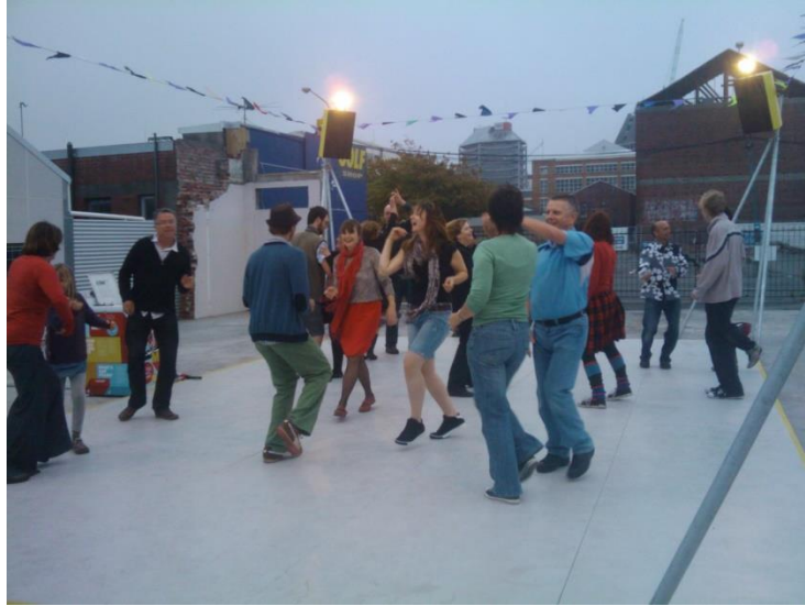
17: Gap Filler staff and supporters test out the Dance-O-Mat in its first week of operation (March 2012)

the middle of something that was bigger than us”. 412 Even after some low-life stole the original t-shirts off the clothesline, there was plenty of colour on display at the Dance-O-Mat, in ways that many would not have anticipated.