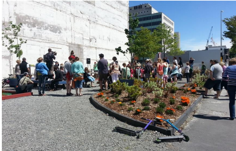
13: People gather for the Sound Garden opening (October 2013)

Gap Filler also created the Sound Garden – an interactive space featuring musical instruments fashioned out of re-purposed materials. Built as part of the Festival of Transitional Architecture (FESTA) in 2013, the Sound Garden was inspired by a video clip featuring Brazilian street musicians installing instruments among the urban landscape. With an emphasis on fun and experimentation, the project gives people the chance to “make some sweet sounds in contrast to the demolition/construction noise scape”. 399 In a city where many may feel like they no longer have control over any aspect of their environment, creating music out of chaos (or even just adding to the noise) places them firmly within the moment and allows them to make an impact. The Sound Garden was one of many Gap Filler projects that showed music can not only be created out of anything, it can be enjoyed anywhere, at any time, without the restrictions that have come to be placed around it – whether those boundaries are made of bricks and mortar or social expectations.