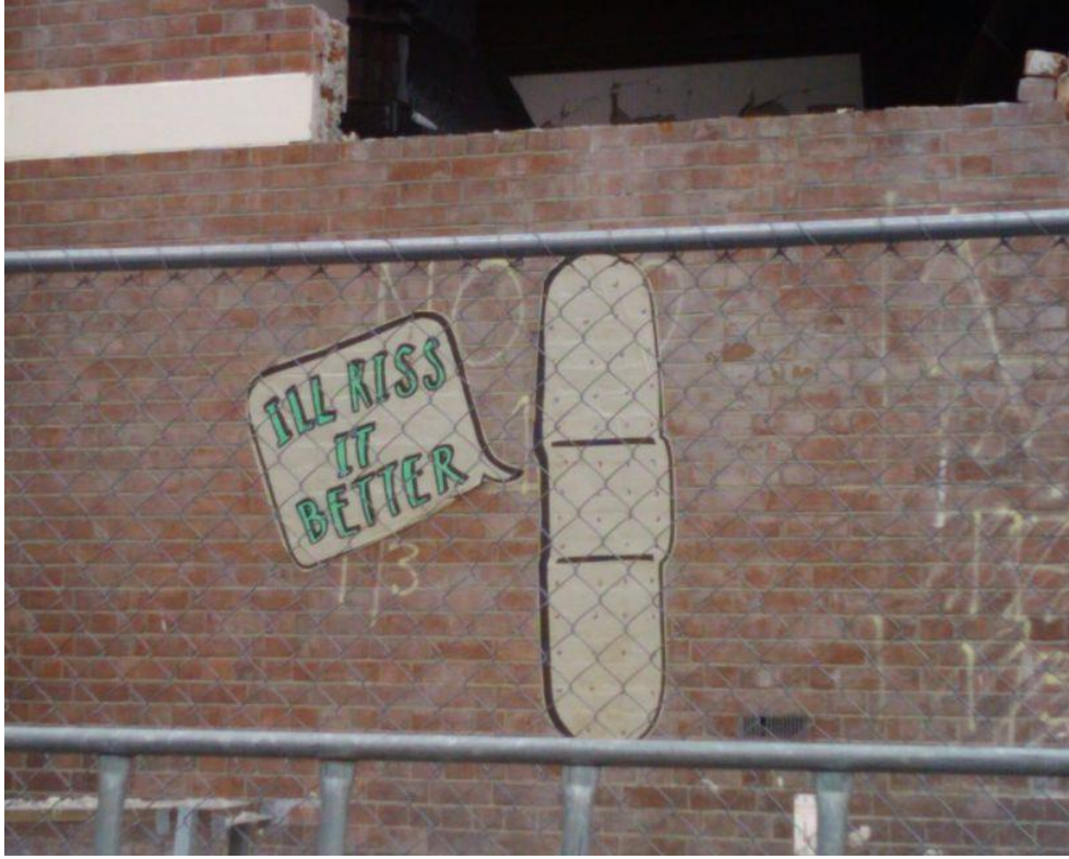
1: Street art, Christchurch

A YouTube playlist has been compiled to accompany this research (full text link and playlist details are in Appendix 1):