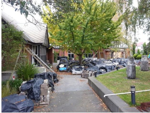
8: The leafy Dux de Lux courtyard, looking through the safety fence (April 2014)

The Dux was always more than just a music venue: they ran a vegetarian restaurant, as well as brewing and selling their own beer, which could be enjoyed in a shaded courtyard space (now a resting place for building materials: see figure 8). When it became clear that the original Dux building was not going to be repaired any time soon, Herrick and Sinke started looking for an alternate space to call home, eventually opening up the different aspects of their business in three separate premises across the city. First to open was a live music venue, Dux Live!, in a light-industrial part of Addington, an area which, along with parts of neighbouring suburb, Sydenham, has been dubbed the SOMO district (South of Moorhouse). Rumours about a new venue first surfaced in the Save our Dux group in May 2011, and the hunt for a temporary live music venue was confirmed by Dux manager, Ross Herrick. However, securing the warehouse space would prove to be the least time-consuming or frustrating part of the process – months of delays working through the CCC building consent process 312 meant the opening date of Dux Live! was pushed back