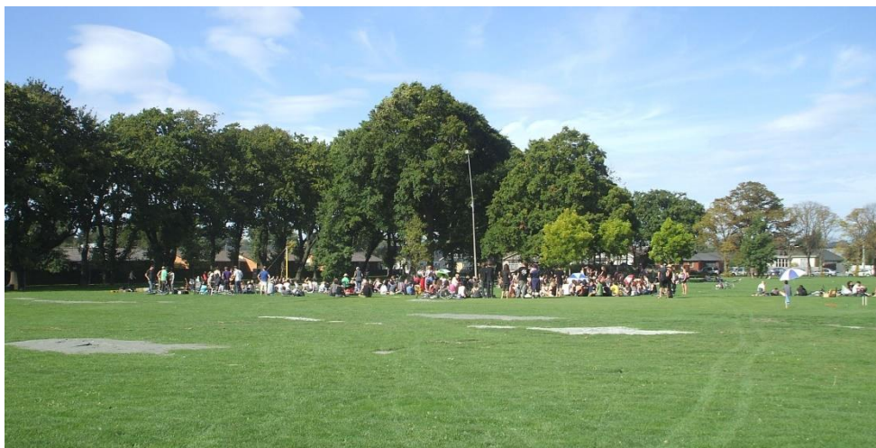
6: The Eastern & friends play for the crowd at St. Albans Park (March 2011)