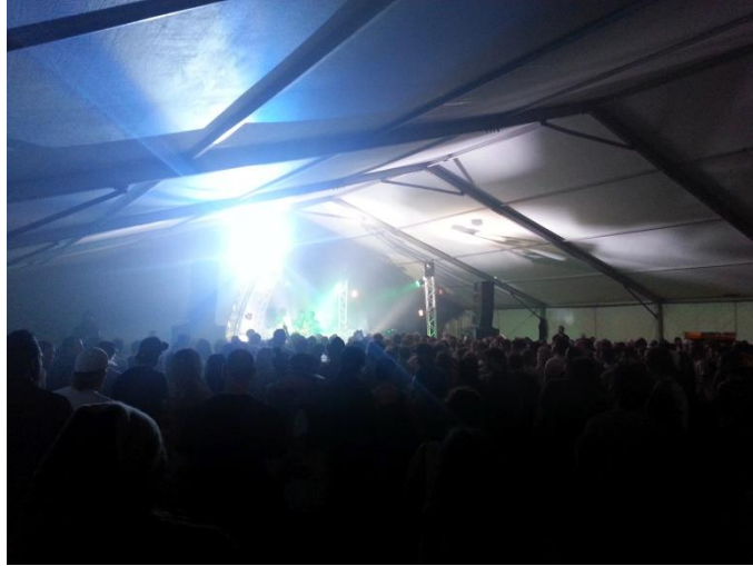
18: DubFX gig in the Bedford Marquee on Madras St (April 2014)

“brilliantly simple cross between art installation and collective therapy,” 415 and although this temporary dance floor is currently at its fourth different location, it seems to have found a permanent place in many people’s lives.