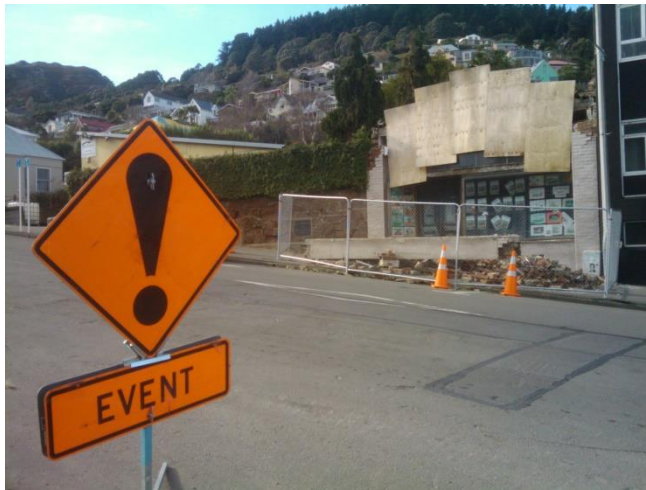
21: Sign of the times – counting down to a street party in Lyttelton (July 2011)

event after a disaster “is crucial, and actually a real strength if you can harness it, and a good way to do that is to enable events to occur”. 451 After disaster, it is important to create or identify spaces and places where people can safely gather, and that need does not dissipate as soon as the immediate danger passes. But it is important to appreciate that communitas cannot be made to order or produced on demand.