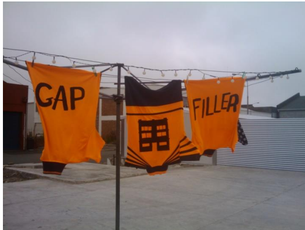
16: Shirt tales, Dance-O-Mat site #1 (March 2012)

Mat site, with the addition of a rotary clothes line complete with the kind of flouro t-shirts sported by most construction and demolition workers around the city (see figure 16).