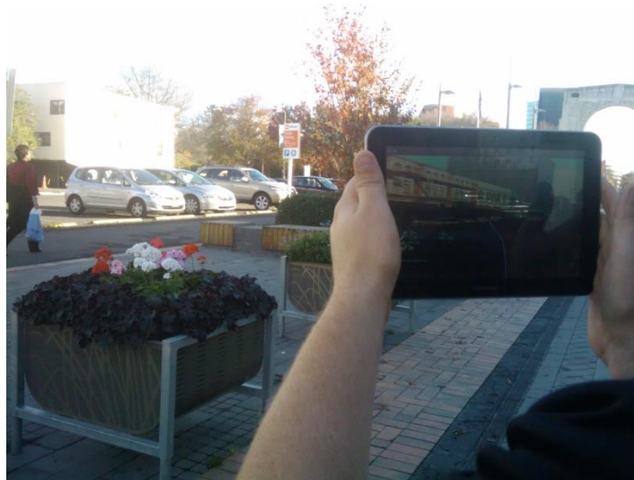
11: A HITLab employee demonstrating the CityViewAR app, City Mall (May 2012)

weaving a rich and colourful tapestry about a favourite part of Christchurch’s social scene.