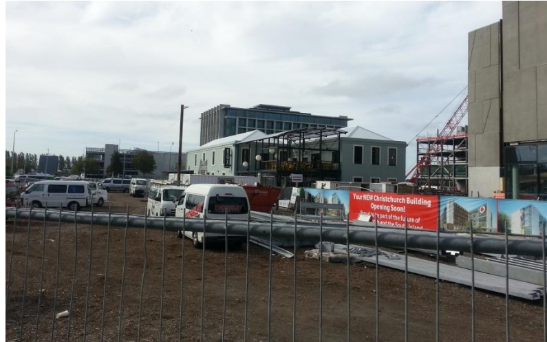
10: Dux Central, surrounded by construction & empty space (March 2016)

looking at pictures, or in seeing it as it is, it's the old city that pushes its way to the front". 323 Others expressed relief that they were not the only ones feeling strangely homesick in their own town, homesick for a place they never left but that had somehow left them.