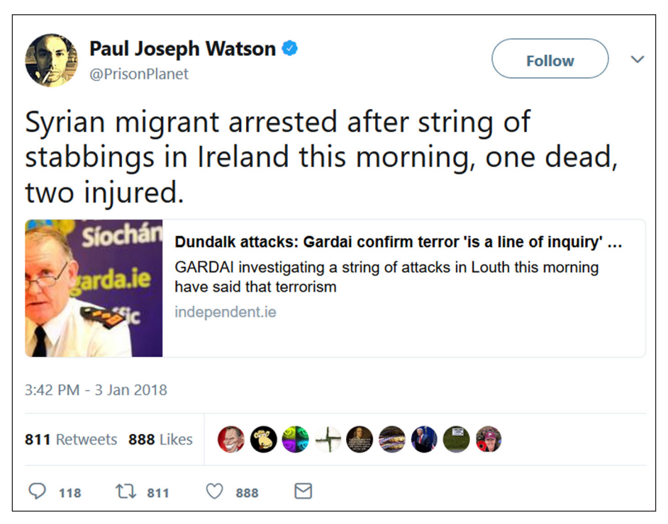
Figure 1: Paul Joseph Watson, InfoWars editor, tweets about Dundalk.

mainstream digital sphere. Pushing a xenophobic and anti-immigrant agenda in turn relied on direct attacks against Muslims and/or refugees and attacks against mainstream media. The first tweet by a pseudonymous account using a fake stereotypically Muslim name immediately sought to make a connection between the incident and immigration even when such connections were not made by the media: '#BreakingNews #MigrantCrisis #Dundalk https://www.rte. ie/news/2018/0103/930792-dundalk-death/'. Other examples include: 'Dundalk stabbing assailant reportedly a Syrian migrant which means media blackout is imminent. Always remember #DiversityIsOurStrength' 'RTE News at One calling the #Dundalk Syrian man a teenager. They've said 'teenager' multiple times. This is why people despise the news media'