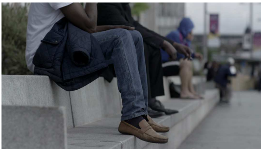
Figure 2 The act of sitting