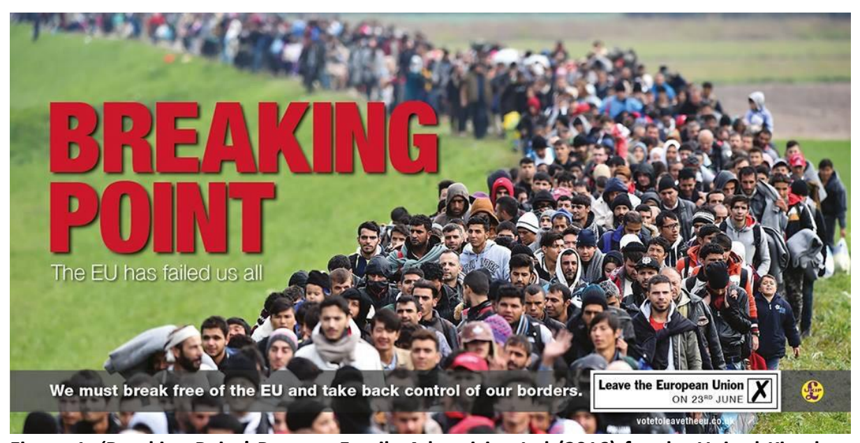
Figure 1: 'Breaking Point' Poster - Family Advertising Ltd (2016) for the United Kingdom Independence Party

The response to the Brexit vote among academics has, at times, felt uneasy. Immediately after the Brexit vote on June 12<sup>th</sup> 2016, on campuses and over the twittersphere, scholars began to process the unfolding political event, reacting personally, analytically and emotionally. Attempts at interpreting the referendum outcome coalesced into a tense mixture of surprise, uncertainty, inevitability, outrage and loss. The various reactions felt by colleagues in the academy perhaps reflected our own positionality as relatively privileged, somewhat mobile, socially liberal professionals, generally at a safer distance from the economic and political frustrations and ideologies that the Leave campaign had sought to exploit. In conversation, academics have uttered their concerns, even their disdain, for their fellow citizens who had chosen to vote for the UK to exit the European Union. The resurrection of nationalist political rhetoric was to continue beyond the Brexit vote, alienating many of us further; as if to add insult to injury the UK Prime Minister went on to declare that those who felt that they were citizens of the world, were in fact 'citizens of nowhere'.