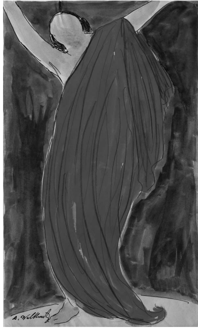
FIGURE 1 Abraham Walkowitz, Isadora Duncan, n.d. Pencil, watercolor, and pen & ink on paper, 17 13/16 × 12 1/4 in. (45.3 × 35.1 cm). Smithsonian Institution, Hirshhorn Museum and Sculpture Garden, Gift of Joseph H. Hirshhorn, 1966.