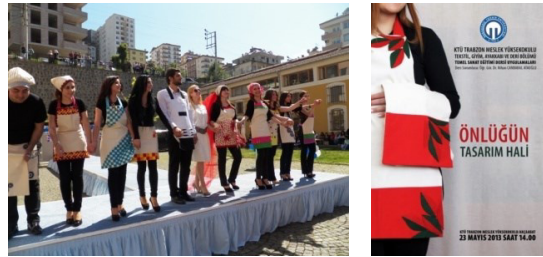
Figure 3. Presentation of aprons with a street fashion show, Activity poster (Design by Oguzhan Mumcu)

The final products of the course taught within the triangle of theory, design and practice are exhibited at the end of the semester by presenting these three stages and consequently a discussion environment is provided. The theoretical studies and final products obtained at the end of basic art training course are presented on two interrelated platforms. At the end of the semester, the most successful ones among the two dimensional studies through which theoretical knowledge is analyzed and designed are exhibited on a platform. Around the platform on which these abstract studies are exhibited, a podium is installed. The final products through which these two dimensional designs are transformed into practice are presented on the podium of a street fashion show with the voluntary model group comprising of students. (Figure 3, 4)