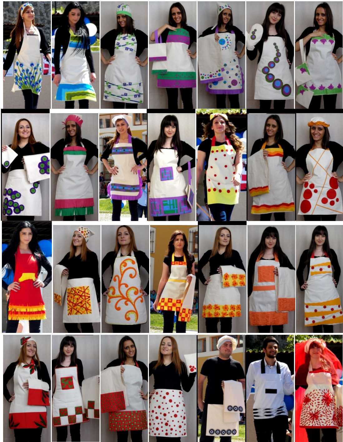
Figure 4. Designed aprons