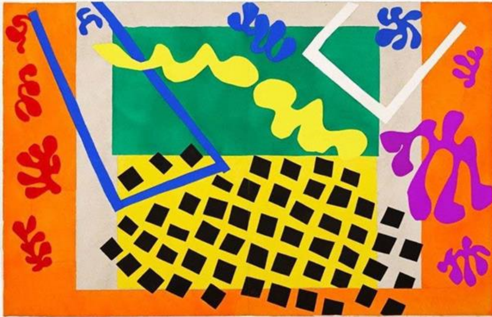
Fig.1, Henri Matisse, The Codomas , 1947, Paris, Tériade, in 'Jazz', 78–79, (© Succession H. Matisse/Copyright Agency, 2019)