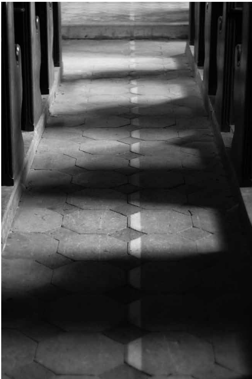
Figure 6. Katy Armes, 'NoThing', 2011, St John the Baptist Church, Hellington, Norfolk.