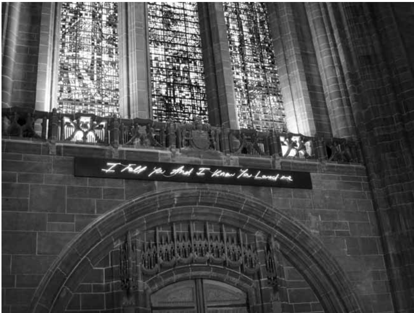
Figure 2. Tracey Emin, 'For You', 2008, Liverpool Anglican Cathedral.

In each case, no clear Christian symbolism is evident, nor do they necessarily invite accessibility. One is motivated by diagrammatic abstraction, the other informed by minimalism; one follows a programmatic grid, the other is vaporous and ethereal; each is designed to invite contemplation yet each works with unconventional form and ambiguous meaning. Similarly, neither Tracey Emin's permanent neon work, 'For You', in Liverpool's Anglican cathedral, nor Rose Finn-Kelcey's 'Angel', temporarily sited atop St Paul's Parish Church in London, offers a straightforward aesthetic, clear symbolism or certain accessibility. Although we might think we know to whom Emin's fluorescent statement – 'I felt you and I knew you loved me' – is directed, this cannot be taken for granted. And, although as a work of light it clearly resonates with the aesthetic quality of the stained glass directly above it, what about the fact that it is delivered in an aesthetic form whose nearest equivalent is the electric signage found in any public institution today? There are many for whom the use of neon represents tawdry populism ill-suited to what might otherwise be read as a statement of devotion. In fact the work is surprisingly nuanced. Unlike the neon texts of Bruce Nauman or Martin Creed, the thicks and thins of Emin's pink neon script replicate the personality of the written hand, adding a candid