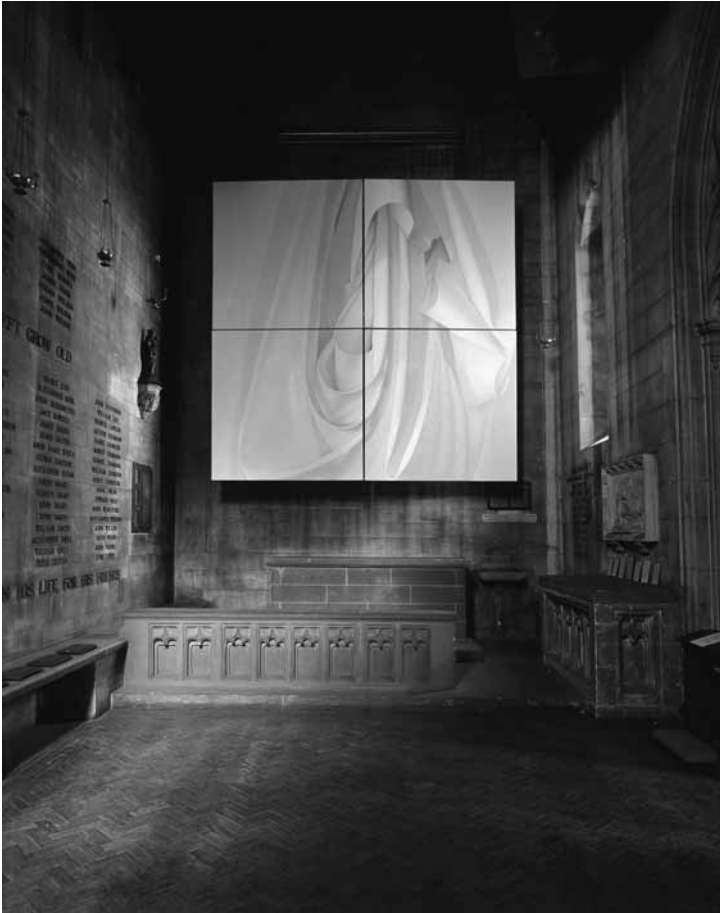
Figure 4. Alison Watt, 'Still', 2003–4, Old St Paul's Episcopal Church, Edinburgh, Scotland. Image courtesy of the artist and Ingleby Gallery, Edinburgh, and Old St Paul's Episcopal Church. Photograph by Hyjdla Kosaniuk Innes.