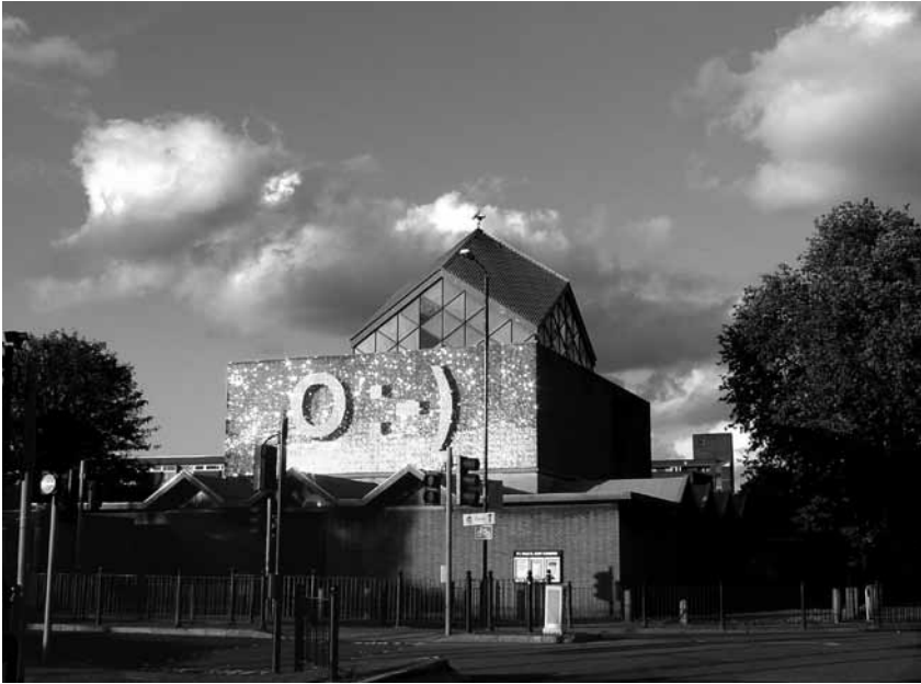
Figure 3. Rose Finn-Kelcey, 'Angel', 2004, St Paul's Parish Church, London.

note of intimacy to a very public setting. Set beneath the enormity of Carl Edwards's colourful and multi-fragmented window, Emin's text posits a still and meditative focal point, offering the viewer an affective, tender statement; mawkish perhaps, but sincere, a human dimension within the cavernous proportions of the nave.