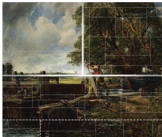
The Lock (1824) by John Constable dissected based on an information-theoretic partitioning algorithm. Adapted from Constable, John. 1824. A Boat Passing a Lock .

Works of art are typically described in qualitative terms rather than systematically analyzed with mathematical methods. Byunghwee Lee, Min Kyung Seo, et al. (pp. 26580–26590) used information theory to characterize the spatial composition of 14,912 digitally scanned Western paintings made over a 500-year period. An algorithm segmented paintings vertically and horizontally in sequential steps, from the most prominent to the least informative compositional features. Horizontal partitions outlined the sky, earth, and atmospheric color changes, whereas vertical partitions bordered trees, plants, buildings, and cliffs. The authors found that different compositional patterns characterized different artists, artistic styles, and time periods. Approximately 87% of the paintings were segmented horizontally in the first step, and the position of this dominant horizontal