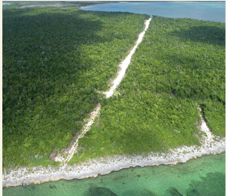
Aerial view of dense, broadleaf, seasonally dry forest, a widespread habitat in the Bahamian Archipelago in the Wilson City area of Abaco Island, The Bahamas.

Humans arrived in the Bahamas 1,000 years ago, and prehistoric climate shifts have altered habitats, especially the transition from the relatively cool and dry Pleistocene to the current warm and wet Holocene. However, the influence of such factors on the biodiversity of the islands' bird species is unclear. David Steadman and Janet Franklin (pp. 26833–26841) report that 69% of landbird species in the Pleistocene fossil record have currently different distributions. The authors charted species composition over time in four fossil sites across four islands in the Bahamian Archipelago. Out of the 90 species identified in the fossil sites, 62 species are either locally extinct and no longer found on that particular island or globally extinct. Species losses were distributed across habitats and feeding types, including insectivores and scavengers, though more species were lost from the pine and broadleaf forests during the period of rising sea levels and the transition from the Pleistocene to the Holocene. According to the authors, the factors that likely fueled these extinctions, including increasing storm severity and human expansion, are currently in play, leaving bird populations at risk. — T.H.D.