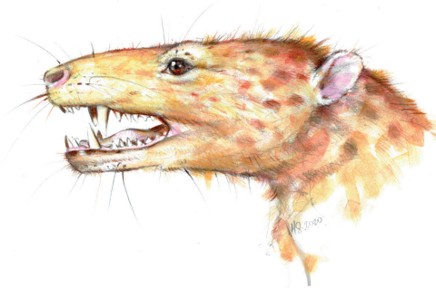
An artistic reconstruction of a mammaliaform from the Triassic of Greenland (Right) and the 3D reconstruction of the molar-like tooth (Left). Illustration credit: Marta Szubert (artist).

and lower tooth contact during biting, compared with single-rooted teeth. According to the authors, the results suggest that molar-like teeth with crowns may have developed together with biomechanically optimized dual roots. — P.G.