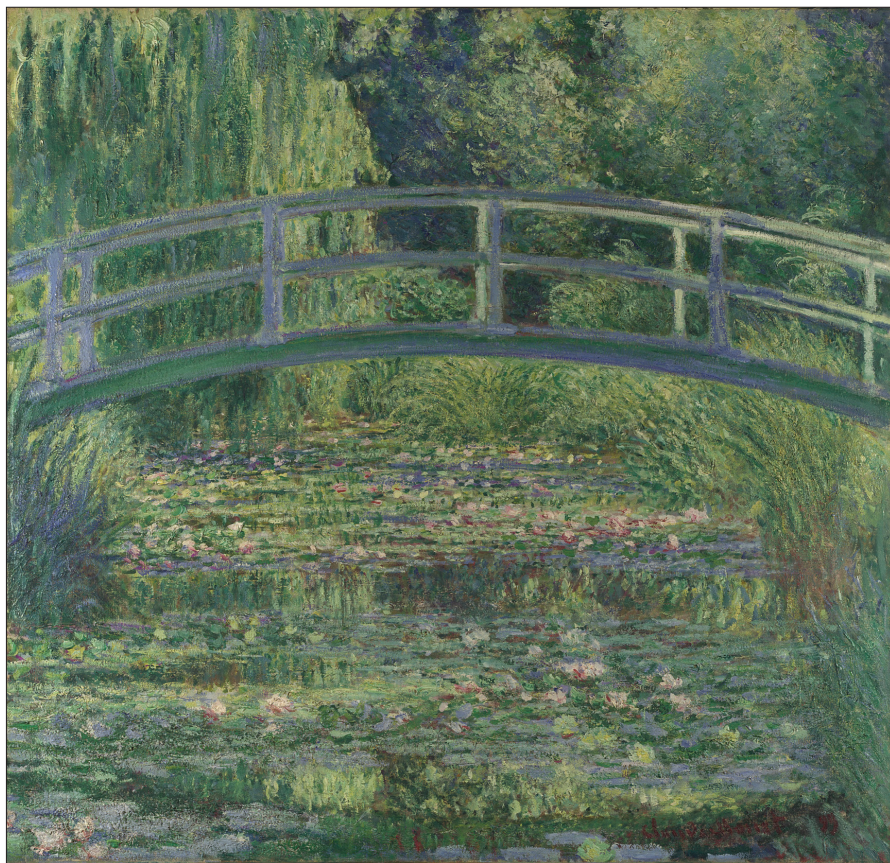
Figure 1. Claude-Oscar Monet. The Water-Lily Pond 1899

was adamant to avoid surgery at all costs. He argued that: