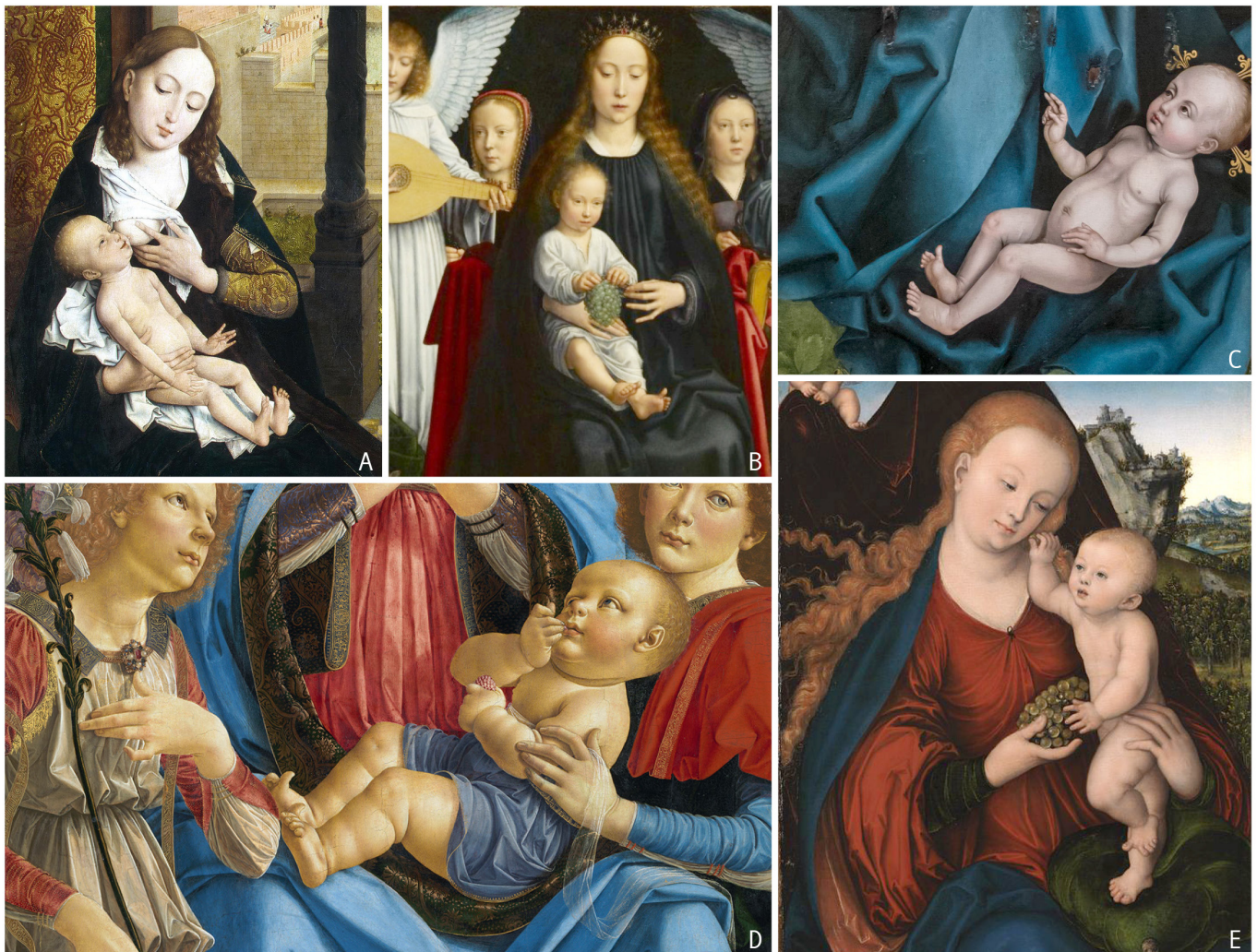
Fig 2 | Details from five paintings depicting a Babinski sign. A: Rogier van der Weyden, St Luke Drawing the Virgin (1435-40), Boston Fine Arts Museum (USA). B: Gérard David, Virgin Among the Virgins (c1509), Musée des Beaux-Arts de Rouen (France). C: Martin Schongauer, Orlier Altarpiece (1470-75), Musée Unterlinden, Colmar (France). D: Verrocchio, The Virgin and Child with Two Angels (1476), National Gallery, London (UK). E: Lucas Cranach the Elder, The Virgin and Child with a Bunch of Grapes (c1525), Alte Pinakothek, Munich (Germany)

The practice of copying works of art was frequent during the Renaissance, particularly for Virgin and Christ Child paintings. The painting Saint Luke Drawing the Virgin , of which many copies exist, is a clear example of this. 18 However, examples of serial paintings, such as Madonna and Child with the Milk Soup by Gérard David, which was reproduced in at least three versions, are rare. The Babinski sign is not present in the version of this painting exhibited in the Palazzo Bianco in Genoa, whereas it is present in the other two versions. Cranach the Elder frequently produced serial paintings of the Madonna and Child, reproducing the Babinski sign each time, but this phenomenon cannot explain the occurrence of the sign in other paintings by the same artist, such as The Virgin and Child with a Bunch of Grapes (Fig 2, E).