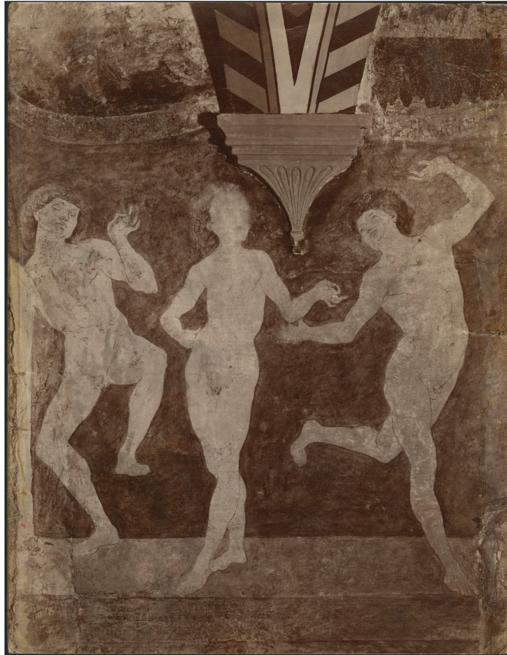
Fig. 4: Antonio Pollaiuolo, Fresco showing the 'Dancing Nudes', c. 1465, Villa La Gallina, Arcetri (Florence), Villa I Tatti, The Harvard University Center for Italian Renaissance Studies, Fototeca Berenson. © President and Fellows of Harvard College.

Indeed, while her monograph aspired to make a substantial historical contribution to scholarship on the Pollaiuoli by including a copious appendix of documents, its aesthetic principles show the strong influence of Bernard.