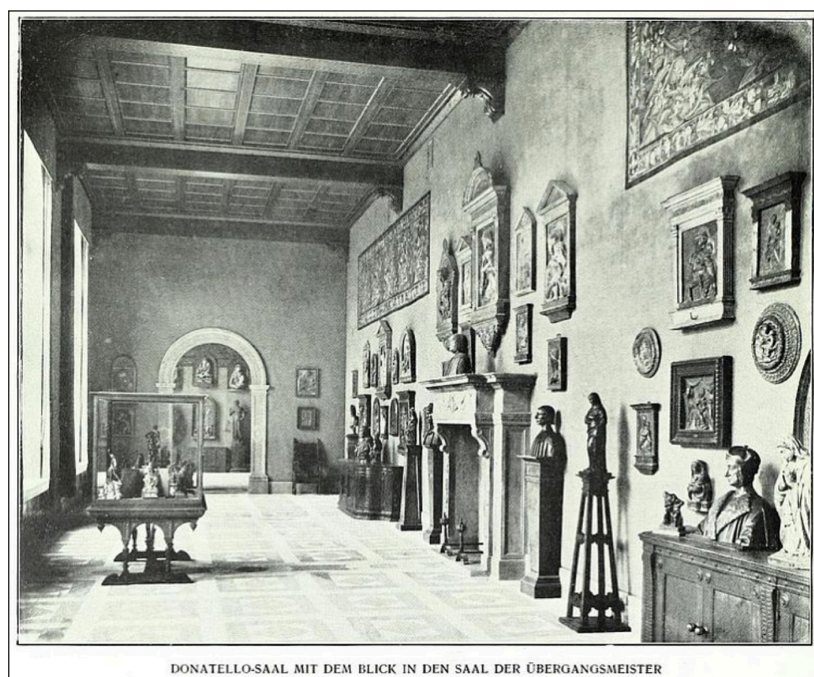
Fig. 2: The Donatello Room at the Kaiser-Friedrich-Museum, 1904.

Bode is interesting. He is very learned and knows so much about the history of Renaissance sculpture and writes delightfully, clearly and concisely, but he seems without any sense of what is good in art. If he finds the same kind of fold or the same motive or some school likeness, it is enough for