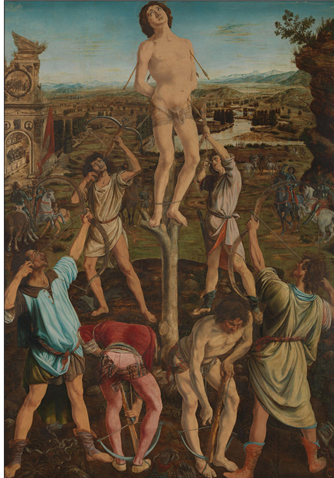
Fig. 5: Antonio and Piero del Pollaiuolo, The Martyrdom of Saint Sebastian , 1475, oil on wood, 291.5 × 202.6 cm.

While the Morellian method prescribed the study of static physiological forms that bear the trace of an artist's individuality, Cruttwell's writing followed Berenson in the attempt to set forms into motion in order to create a description of the psychology of the artist as well. Particularly interesting is the language that she uses in the passages where she describes the movement of the archers she attributes to Antonio, and the effects these bodies have on the beholder: