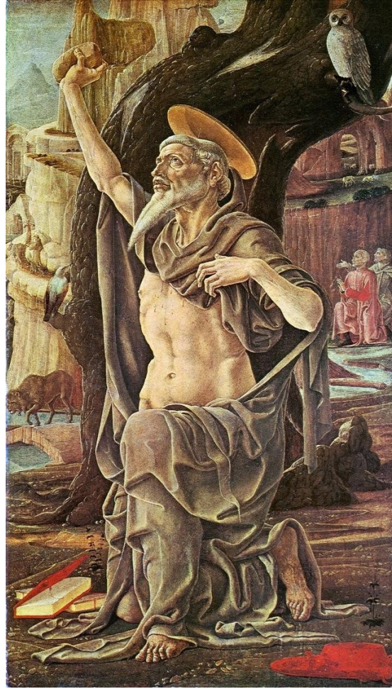
Fig. 9 Cosmè Tura, Saint Jerome , oil on panel, 1470.