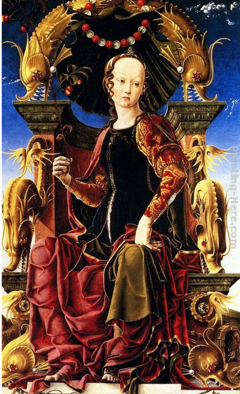
Fig. 7 Cosmè Tura, An Allegorical Figure (Muse?)(Calliope?) , oil and tempera on panel, 1447-1457.