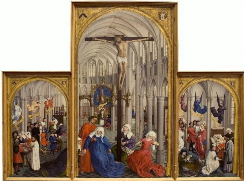
Fig. 5 Rogier van der Weyden, Triptych of the Seven Sacraments , oil on panel, 1445-1450.