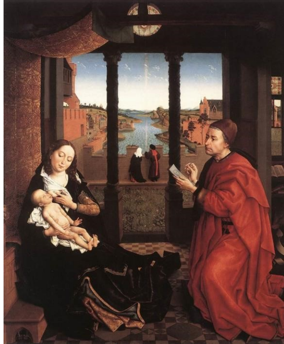
Fig. 4 Rogier van der Weyden, Saint Luke Drawing the Virgin , oil on panel, 1435- 1440.