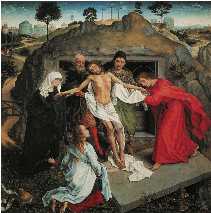
Fig. 2 Rogier van der Weyden, Entombment: Lamentation of Christ's Body , oil on panel, 1463-4.