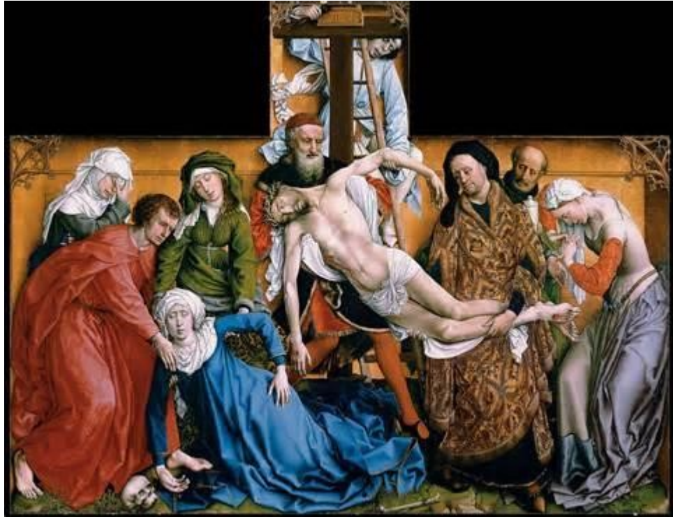
Fig. 1 Rogier van der Weyden, Descent From the Cross , oil on oak panel, 1435.