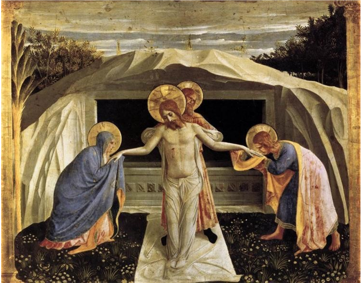
Fig. 3 Fra Angelico, Entombment , tempera on panel, 1463-4.