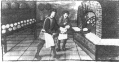
The Bodleian Library, Oxford