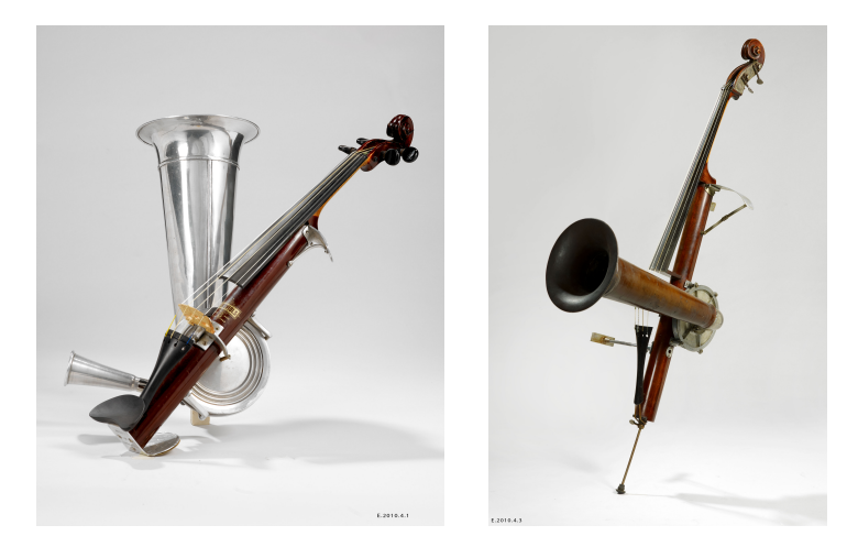
Figure 2: A violin (E.996.10.1, Collection of Musée de la Musique – Paris [13]) and a cello (E.2010.4.3) made by Augustus Stroh, after his patent n° 9418 "Improvements in Violins and other Stringed Instrument", filed 4 May 1899 and registered 24 March 1900.

The singular Stroh instruments are hard to classify. Instantaneously categorised as "violin-like instrument" in a listening test, these instruments seem however "half- string, half-wind" instrument (Figure 2). A scientific documentation resulting from a pluridisciplinary collaboration (acousticians, curators, musicians) shows that what could be considered as just curious instruments actually appear to be the work of a talented maker, resulting from the process of the engineer Augustus Stroh to meet his original need, i.e. solving part of the difficulties of the sound recording techniques in their infancy [15]. By shedding light on its genesis and history, and explaining their acoustical functioning, this scientific documentation give these instruments a new place in the instrumentarium and make them integral musical instruments. In this sense, this documentation can disrupt the values likely to be conveyed by the instruments and modify their perception by spectators.