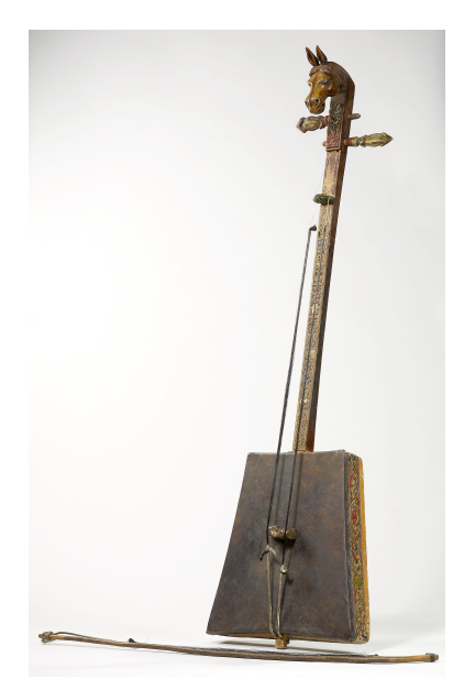
Figure 5: Viele morin huur (E.2009 2.1, Collection of Musée de la Musique – Paris [13]).

the existence of the object itself, these studies will allow this instrument to be the vehicle and the survival tool of an oral culture in movement.