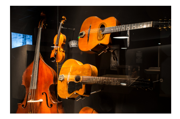
Figure 3: A "big mouth" Selmer-Maccaferri guitar at the top and a "small mouth" Selmer jazz guitar below, as presented during the Django Reinhart exhibition at Musée de la Musique in 2012.

These obvious organological differences would normally foreshadow a sound contrast between the two instruments. However, acoustical analyses contradict this assumption. The global responses of both instruments appear similar: the spectral analysis presented in Figure 4 shows a similar distribution of the radiated energy as a function of frequency, mainly spread between 200 and 400 Hz (band 2). The measured differences between the two guitars are of the same order of magnitude as the differences between guitars of the same model.