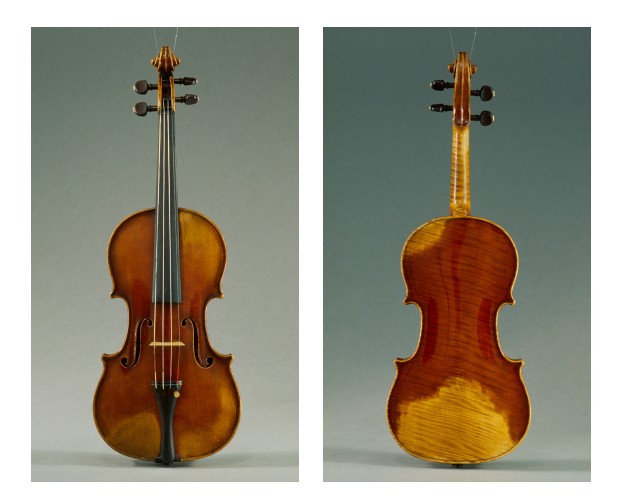
Figure 1: Violin made by Nicolas Lupot (E.996.10.1, Collection of Musée de la Musique – Paris [13]). Sometimes called "The French Stradivari", Lupot was very active in Paris at the beginning of the 19th century. His instruments are largely inspired by Stradivarius models, which he was able to access thanks to his reputation as a repairer. The label inside the violin reads "Nicolas Lupot luthier rue de Grammont à Paris l'an 1803". Its neck was changed at least once and its set-up is typical of the first half of the 20th century, as indicated by its "Émile Français Paris" iron-stamped bridge. Copyright Cité de la musique - Philharmonie de Paris

the opening ceremony of the new museum in 1995. A few years later in 2002, the same violin allowed to hear the piece for solo violin written by Ianis Xenakis in 1950, in a tribute concert to this composer. From which period really is this instrument? Is it even from a precise period? What is the real signification of the manufacture year still visible on the authentic maker's tag inside the instrument? What do we hear in each concert: a violin from 1995 or 2002, date of the concerts? An instrument from 1720 or 1950, dates of the creation of the pieces? Or an instrument from 1803 which has the incredible capability of being used for both music written way before and way after its fabrication?