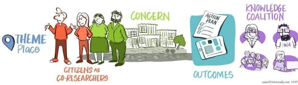
Figure 1: Citizen Social Science in Action, with citizen groups, a specific concern, and with the support of the Knowledge Coalition

In all CoAct R&I Actions (Mental Health Care, Youth Employment and Environmental Justice), citizens in a vulnerable situation are placed at the centre of the research and their role and dedication conceptually recognize them as Co-Researchers . In parallel, the Knowledge Coalition is a network of stakeholders who are informed about the R&I Actions' goals, and play an active role, either participating in or co-designing different actions, to harness Co-Researchers' efforts and implement policies and measures based on scientific evidence.